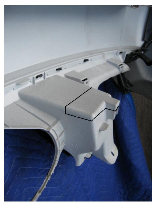
MARK OUT THE INNER BUMPER BEAM AS SHOWN TO THE LEFT.