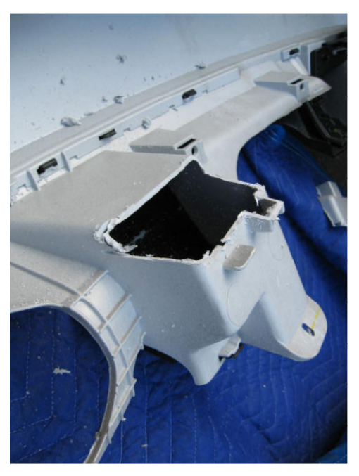
USING A ROTARY OR EQUIVALENT CUTTING TOOL, TRIM BUMPER FASCIA AS SHOWN TO THE RIGHT.