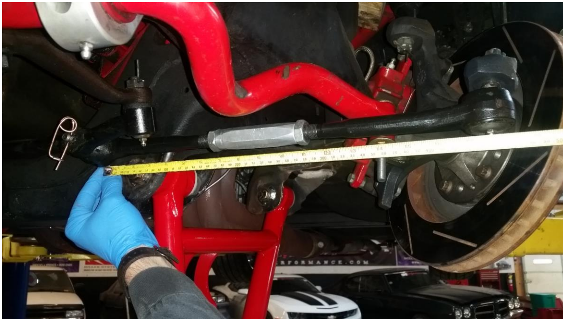
Figure 1: Measure initial tie-rod length