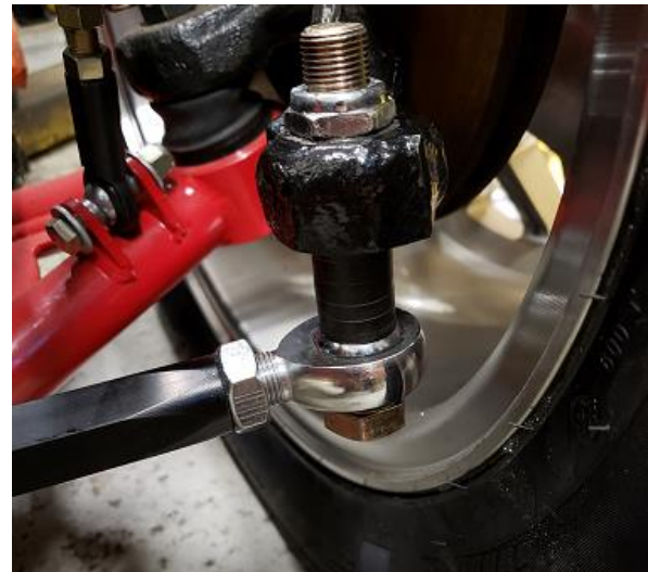
Figure 3: Bolt assembled with spacers