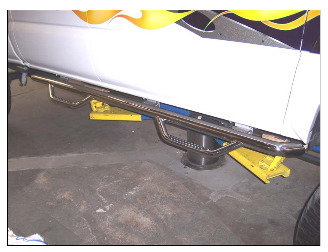
Step 6. Align sidestep with the body and then tighten all mounting bracket and sidestep nuts and bolts. Step 7. Repeat the above installation steps to install the driver side mounting brackets and sidestep.