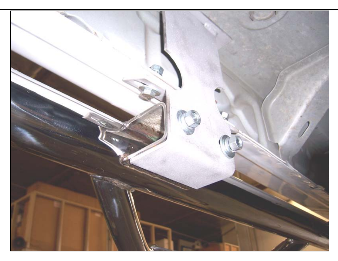
Step 5. Position the passenger sidestep up to the mounting brackets and loosely attach it to the brackets using the 3/8" x 1" hex bolts, flat washers, lock washers and nuts.