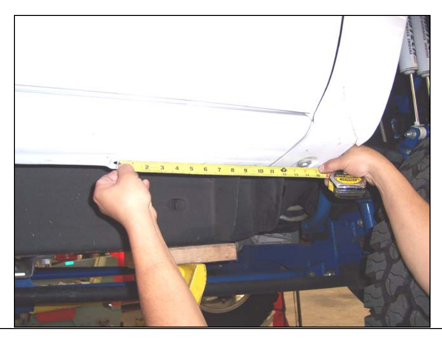
Step 1. Beginning with the passenger side measure rearward from the front fender bolt (refer to diagram for dimensions) and scribe (4) vertical lines on the body pinch mold.

It is the installer's responsibility to confirm all measurements and that there are no obstructions such as brake, fuel or electrical lines before drilling.