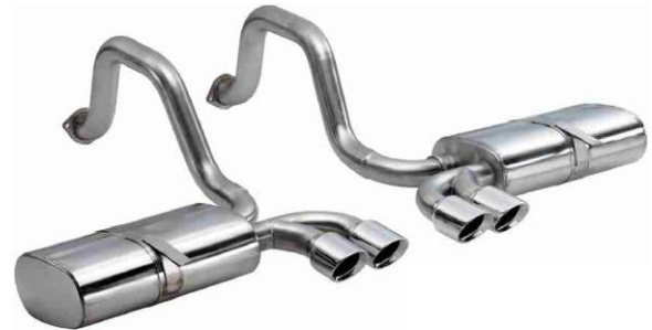
Pro-Series 3.5 Tips