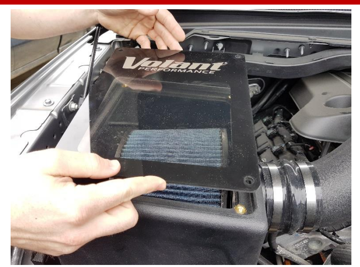
18. Place the lid & gasket assembly on the box.