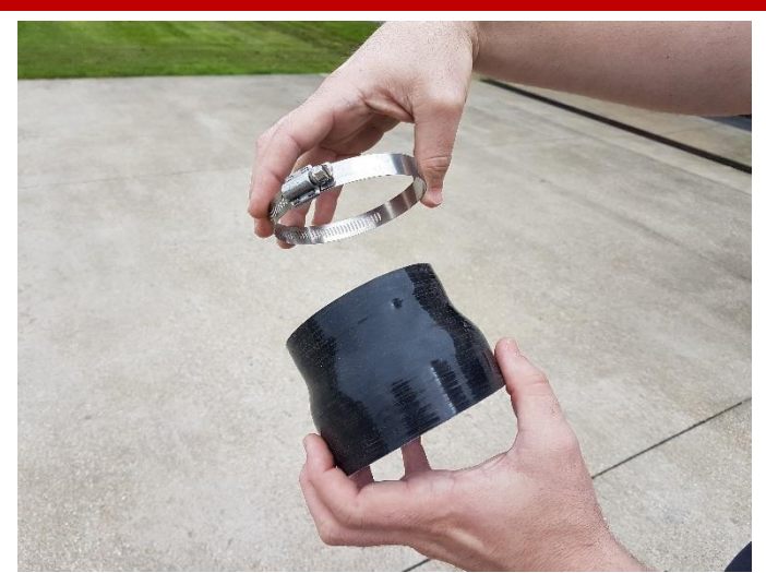
10. Install the 3.5" Clamp onto the small end of the reducer.