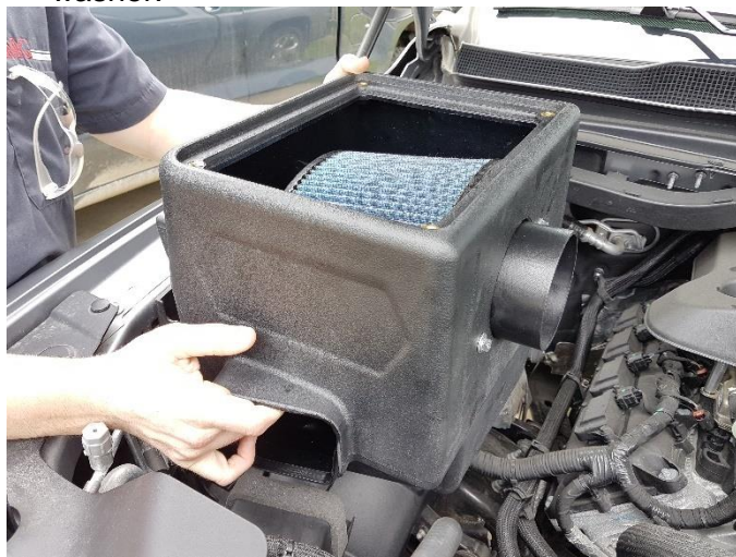
8. Align the four grommets in the Corsa box to the four mounting points in the car as shown.