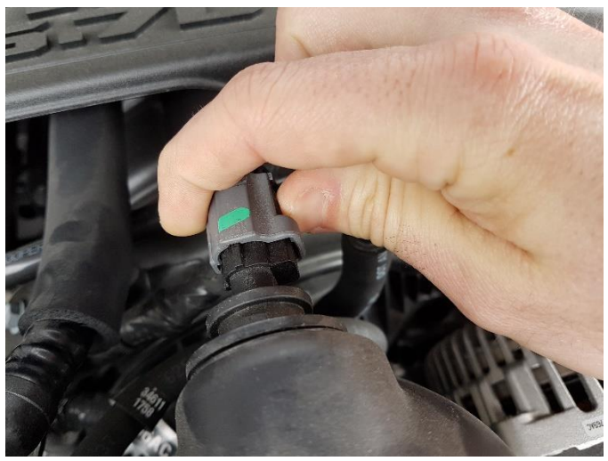
1. Disconnect the air temperature sensor harness from the stock intake tube.