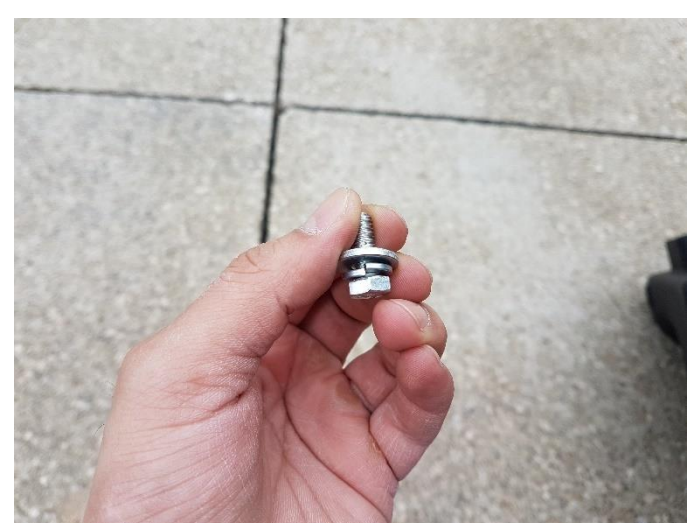
6. Assemble the included screw, washer and lock washer.