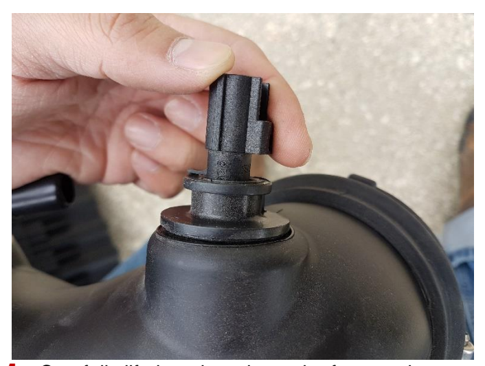
4. Carefully lift the tab and turn the factory air temperature sensor in the stock grommet to unclip it from the duct.