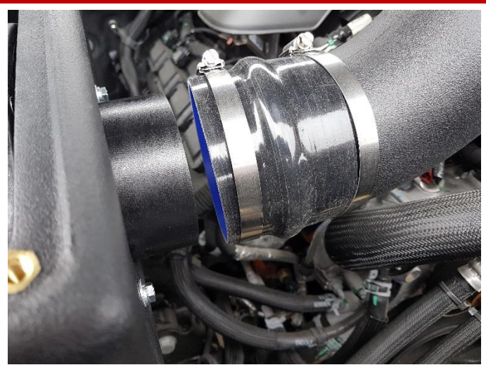
14. Install the last 4" Clamp onto the other end of the hump hose and slide the duct onto the box assembly.