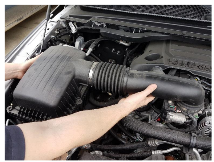
3. Loosen the stock clamp at the throttle body using an 8mm socket & ratchet and remove the stock intake by pulling up on the box and the duct.