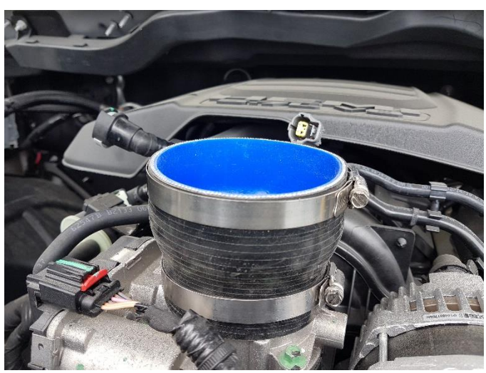
12. Place a 4" clamp onto the other end of the reducer.