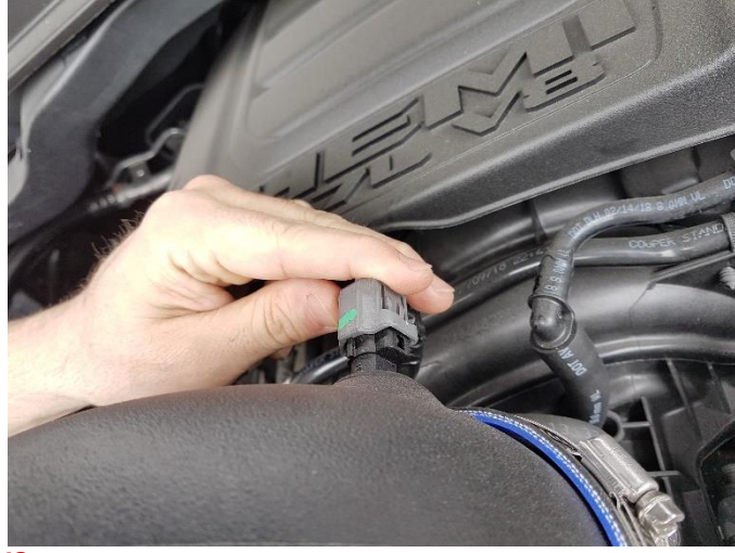
16. Plug in the air temperature sensor making sure that the sensor doesn't get rotated.