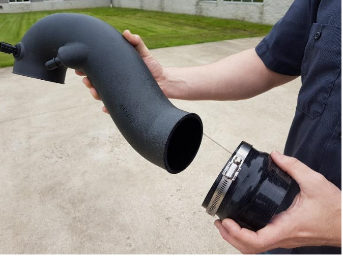
13. Install a 4" Clamp onto one end of the hump hose and slide it onto the duct.