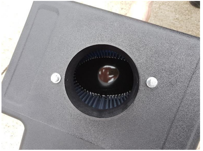
Secure adapter to airbox using a 10mm socket and ratchet.