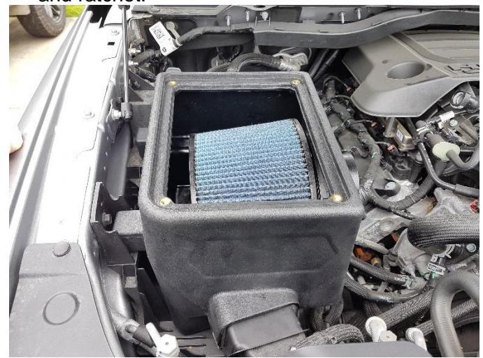
Press the box into the mounting points until fully seated.