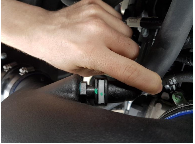
Connect the crank case vent hose to the fitting until it clicks.