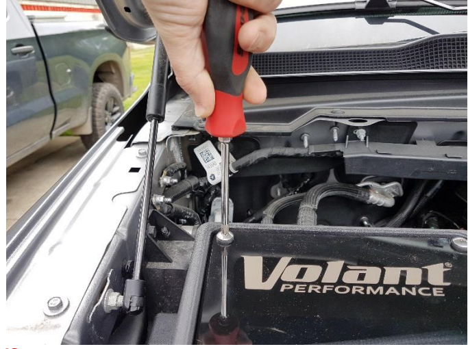
19. Tighten the screws using a Philips head screwdriver.