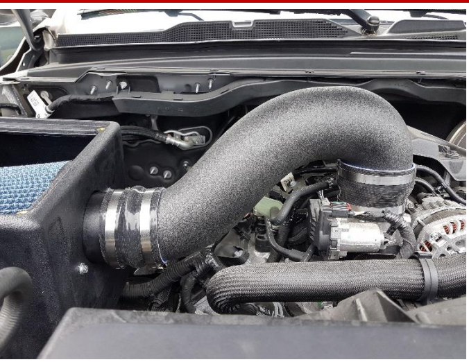
15. Slide the other end of the duct into the reducer on the throttle body then tighten all the clamps using a 8mm socket and ratchet.