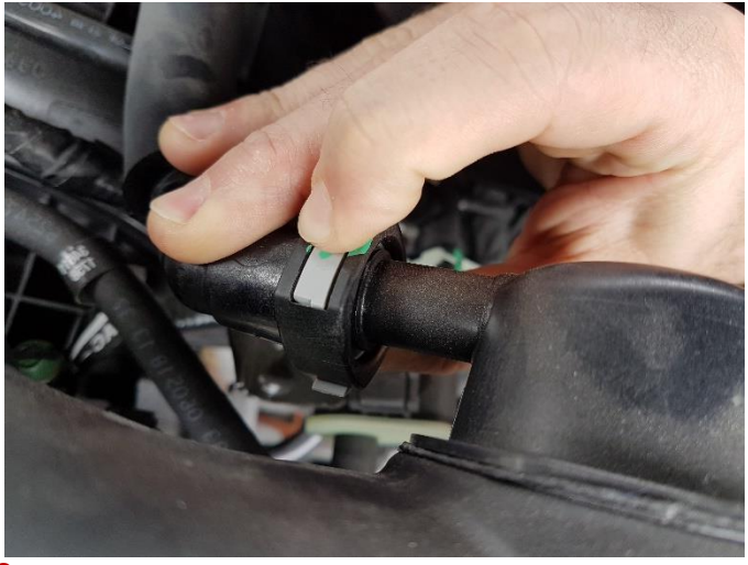
Disconnect the crank case vent hose by pressing the grey tab and gently pulling away.