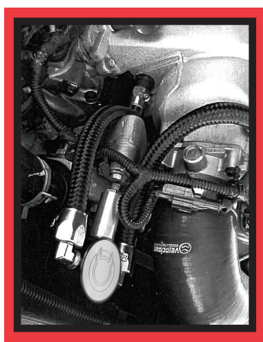
6.1L HEMI CARS