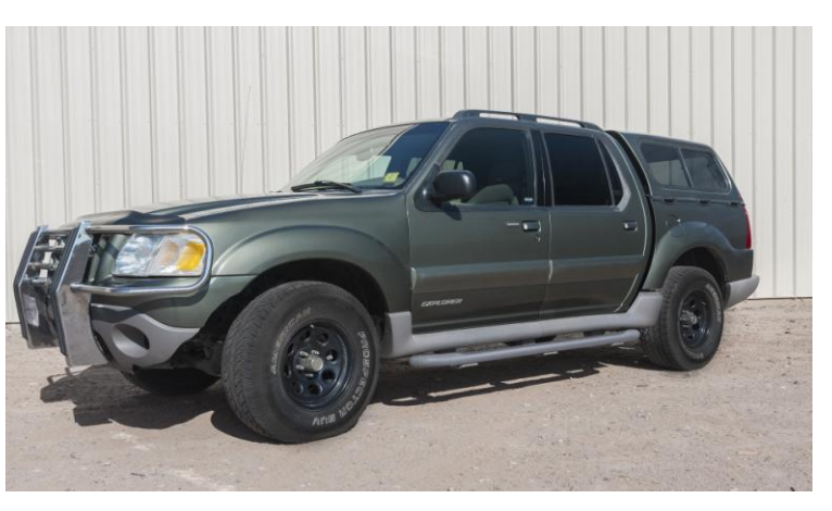
2002 Explorer Sport Trac with Daystar Body Mount Kit