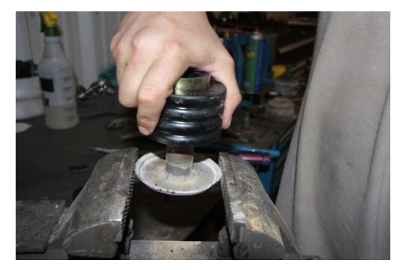
Figure 3: Your Daystar Cab Mounts will slide onto the factory steel shell.

Figure 2: You will be reusing the factory steel shells and the factory mounts will need to be separated, place the factory steel shell in a vice and use a pair of channel locks to work the mount loose. Once the Mount is loose pry up on the mount to remove it from the shell.