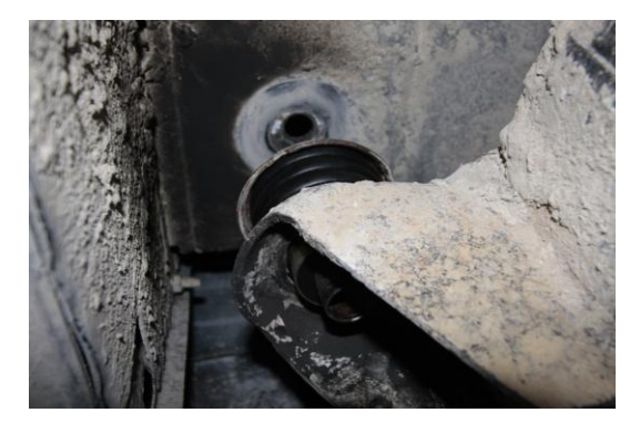
Figure 1: Loosen and remove the bolts at all locations, only do one side at a time. When the bolts are removed you will want to raise the side of the body that you are working on and remove the mounts. Keep track of which mounts came out of which location.