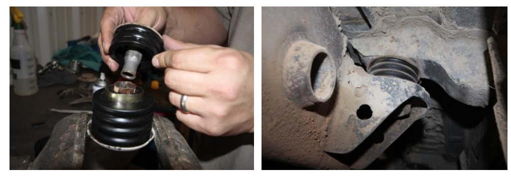
Figure 6: Body Mount location 3, B-Pillar. Use Cab Mounts M02545 (Top) and M02543 Bottom