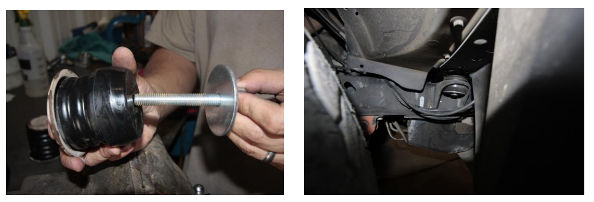
Figure 4: Body Mount location 1, Radiator Core Support. Use Cab Mounts M02539 (Top) M02540 (Bottom) and flat washer

Figure 3: Your Daystar Cab Mounts will slide onto the factory steel shell.