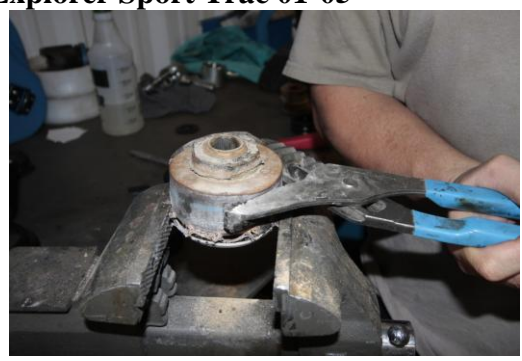
Figure 2: You will be reusing the factory steel shells and the factory mounts will need to be separated, place the factory steel shell in a vice and use a pair of channel locks to work the mount loose. Once the Mount is loose pry up on the mount to remove it from the shell.