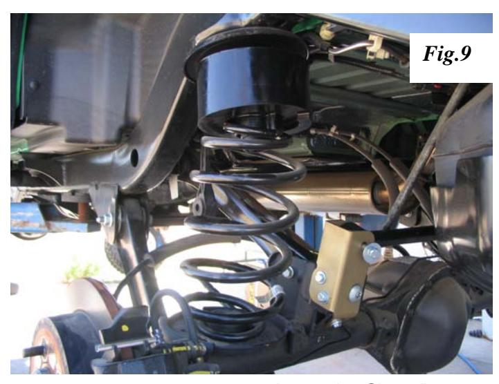
Instruction Sheet P10862-00