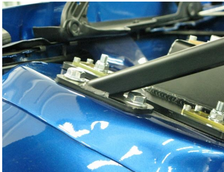
Figure 3 - Install M10 Fasteners