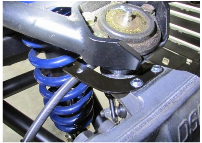
Figure 4 – Install Bracket

4. Place one of the brake hose brackets to the top of the DSE drop spindle so the bracket wraps around the back side of the upper ball joint. Install the bracket to the spindle using two of the provided M5-0.8 x 10 flanged bolts. Use medium strength blue Loctite 242 on the threads of the bolts and tighten (Figure 4).