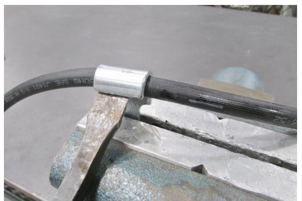
Figure 1 – Remove Hose Clamp

1. Before the brake hoses can be installed, you will need to remove the factory brake hose clamp. Pry the clamp apart and remove it from the hose (Figure 1).