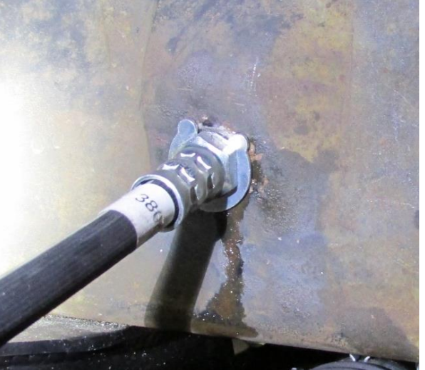
Figure 3 - Install Hose

3. Once the hose fitting will fit into the frame rail, install the brake hose to the brake line and the caliper (Figure 3).