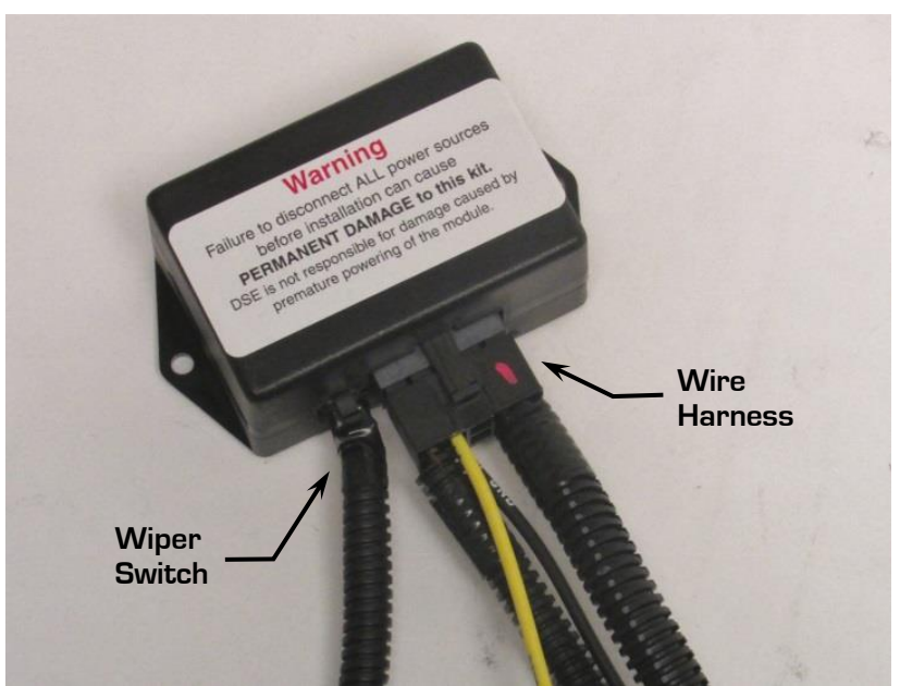
Figure 15 - Connect Wiper Switch & Harness to Module