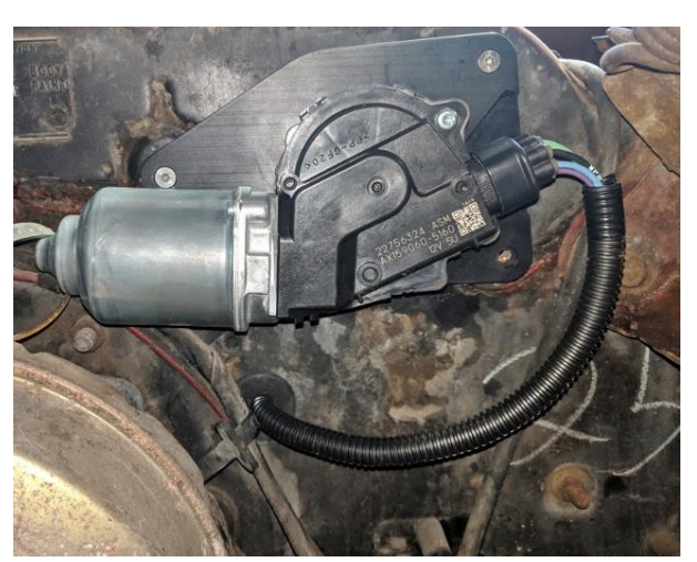
Figure 11 - Install Wiper Motor Harness

13.A rubber grommet is already installed on the wire loom from the wiper motor wires. Once there is enough of the loom through the firewall to connect the wiper motor, move the grommet on the loom and install it into the firewall to seal the engine compartment from the inside of the vehicle (Figure 11).