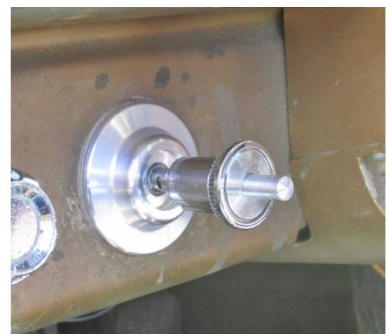
Figure 8 - Wiper Switch Knob Closeout