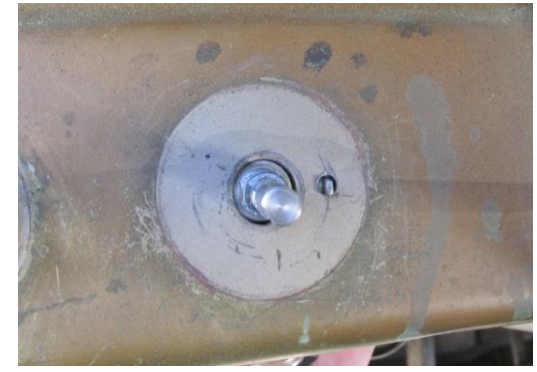
Figure 5 - Drill Anti-Rotation Hole