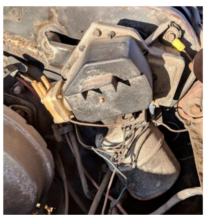
Figure 1 - Stock Wiper Motor