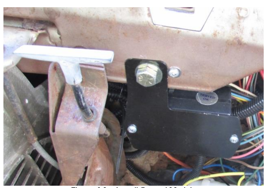
Figure 14 - Install Control Module

17. Install the control module assembly to the bottom side of the dash using the provided 3/8"- 16 \times 7/8 "L hex flange bolt and flange lock nut (Figure 14).