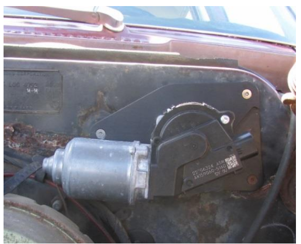
Figure 2 - Mount Wiper Motor

5. Attach the new pitman arm to the original wiper linkage (Figure 3). NOTE: The Selecta-Speed wiper kit is shipped with the pitman arm in the "parked" postion. Do not move the pitman arm by hand to attach the wiper linkage. If the pitman arm is moved from the original "parked" position from Detroit Speed, it may result in the wiper blades stopping in the wrong spot on the windshield.