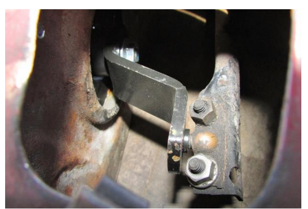
Figure 3 - Attach Wiper Linkage to Pitman Arm

5. Attach the new pitman arm to the original wiper linkage (Figure 3). NOTE: The Selecta-Speed wiper kit is shipped with the pitman arm in the "parked" postion. Do not move the pitman arm by hand to attach the wiper linkage. If the pitman arm is moved from the original "parked" position from Detroit Speed, it may result in the wiper blades stopping in the wrong spot on the windshield.