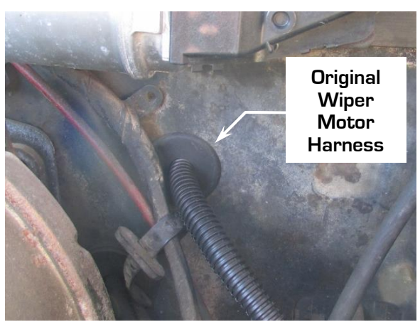
Figure 9 - Wiper Motor Connector