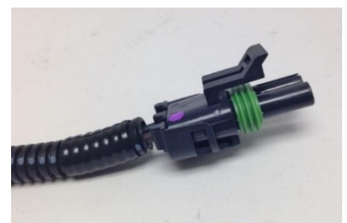
Figure 12 - Washer Pump Connection

14. The Detroit Speed Selecta-Speed harness does include a weather pack connector to install an optional electric inline washer pump into your vehicle (Figure 12). Detroit Speed does offer a washer pump kit you can purchase separately as part number 121102.