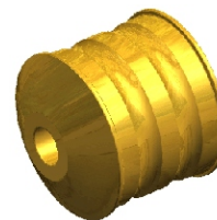
15.10.465.39 Sleeve x 2