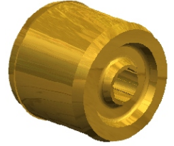
15.10.549.39 Sleeve x 2