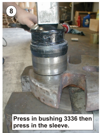
8 Press in bushing 3336 then press in the sleeve.

Energy Suspension recommends that you read over all the installation instructions and check all P/N's and quantities in the parts list before you start. Call customer service at 949-361-3935 if the parts in your kit do not match this parts list.