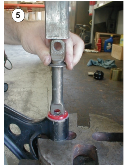
5 Apply grease to all metal parts that contact the polyurethane bushings. Press in bushing 3335 first, then press the pin in. Don't let the pin push the bushing through other side.