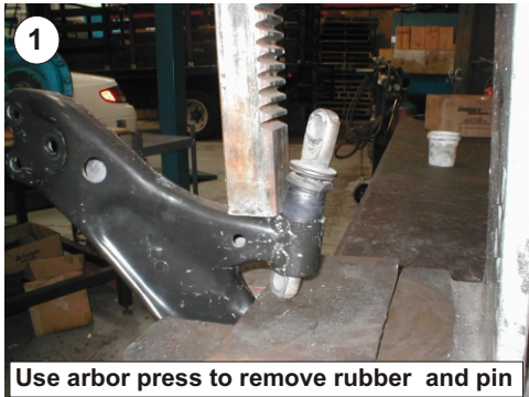
1 Use arbor press to remove rubber and pin

It is recommended that if you are unfamiliar with this type of work that you refer to a qualified service center specializing in this type of work. It is also recommended that if you choose to do this work yourself that a factory service manual be obtained for the proper procedures pertaining to removal, replacement and proper torque specifications for your vehicle. This instruction set is intended as a guideline for the safe installation of Energy Suspension's polyurethane bushings, once you have removed the factory components from your vehicle.