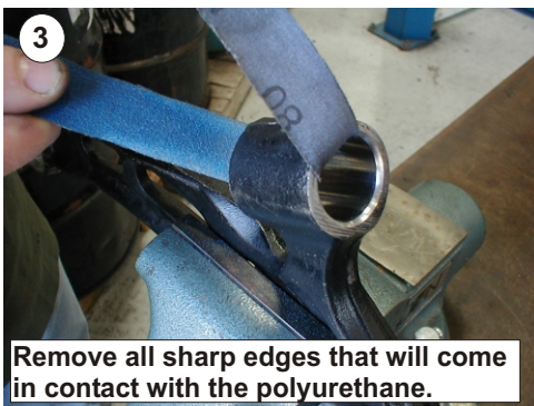
3 Remove all sharp edges that will come in contact with the polyurethane.