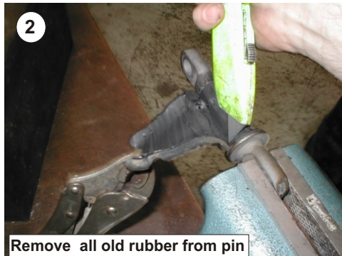
2 Remove all old rubber from pin