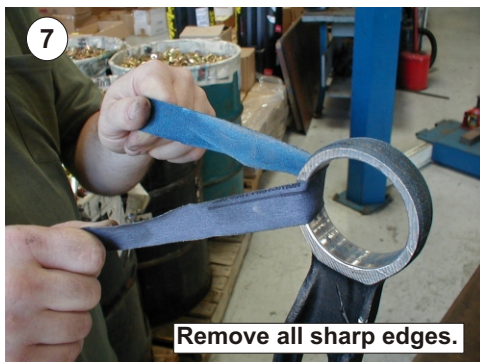
7 Remove all sharp edges.