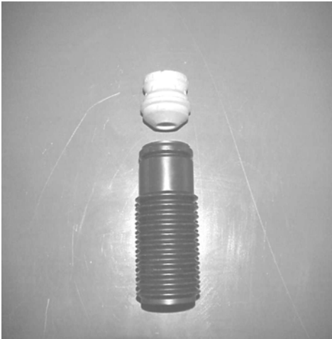
(Eibach front bumpstop / Eibach boot)