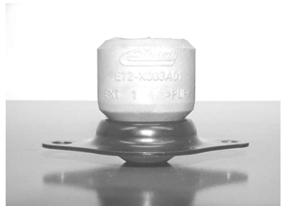
(Eibach bumpstop / OE plate)