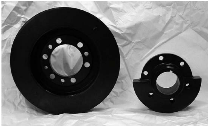
Damper Ring (A)

BALANCING OR MATCH BALANCING -Fluidamprs designed for externally balanced engines include the damper ring (A) bolted to a counter-weighted hub (B). See photo below.