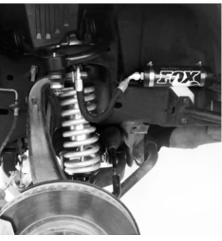
Fig. 2: Passenger side