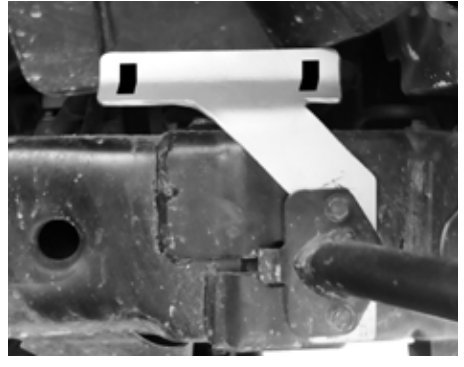
Fig. 3: Reservoir bracket passenger side