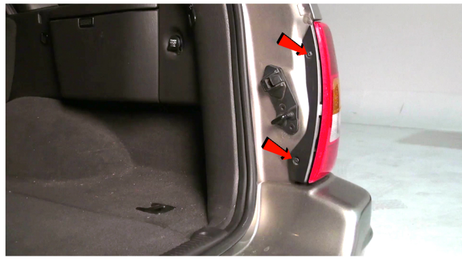
2) Open the tail light access panel by releasing the two tabs.