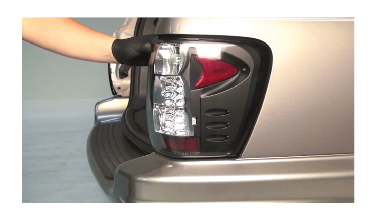
8) Seat the Spyder tail light.