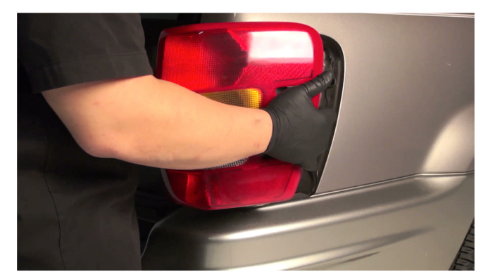
3) Unseat the OEM tail light.