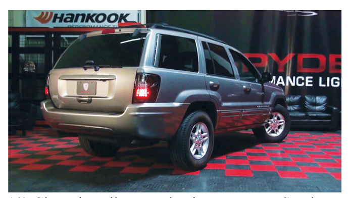
10) Close the tailgate and enjoy your new Spyder tail lights!