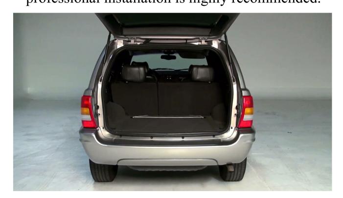
1) Open the tailgate.