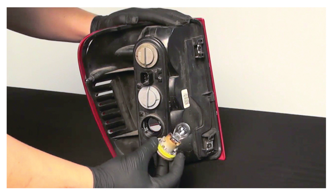
5) Remove reverse lamp bulb from the OEM tail light. Never touch exposed bulbs with bare hands.