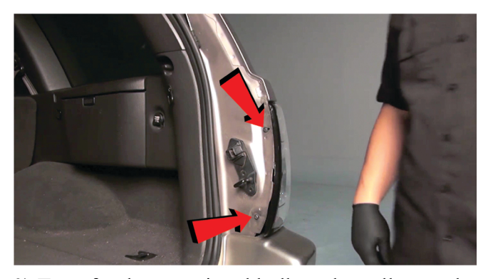
9) Transfer the turn signal bulb to the yellow and black wire bulb socket. Transfer the reverse lamp bulb to the white and black wire bulb socket. Then reinstall the sockets. Now your Spyder tail light is ready to install.