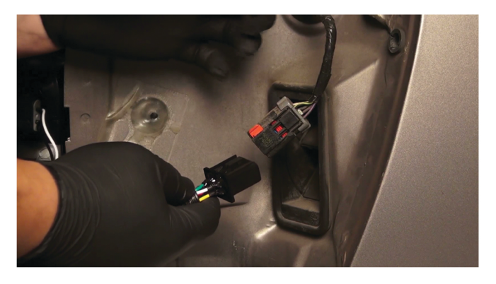
7) Connect the Spyder tail light harness to the main wiring harness. Then push down on the red tab to lock the harness.