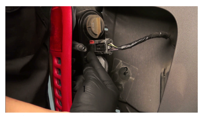
4) Disconnect the tail light wiring harness. Push up on the red tab to unlock the harness, disconnect the harness and remove the OEM tail light.