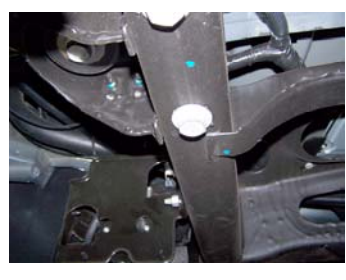
7. Install rear tailpipe hanger #I. Remove hitch bolt as seen in picture. Insert rubber grommet on hanger.

6. Install tailpipe #D into muffler 1.5-2" and secure with clamp #H. Do not tighten. Insert welded hanger into rubber grommet.