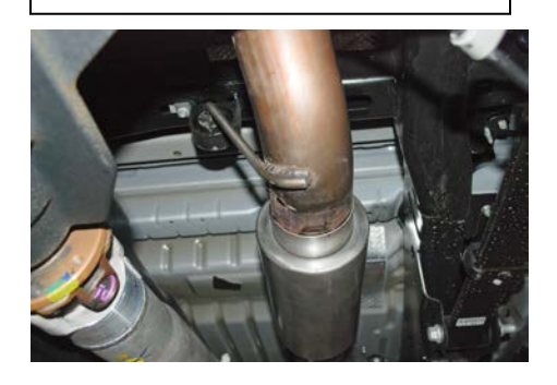
5. With everything loose you may need to adjust the system for proper clearance of shocks, brake lines, ect.

2. Install Head pipe Item # A onto the factory flange. You will re use the factory clamp at this connection. Loosely tighten down the clamp.