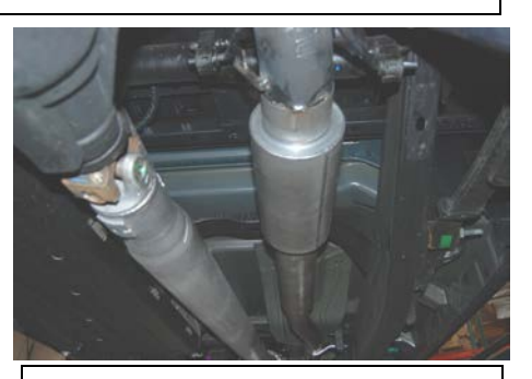
4. Install over axle pipe Item # C into the muffler outlet. Slip the hangers into the rubber grommets and keep tailpipe loose.

6. With proper clearance from spare tire install the exhaust tip onto the tailpipe. The system was designed to have the tip 1" below the quarter panel of the vehicle. With the tip in your desired position begin to tighten down all clamp connections from the front head pipe back.