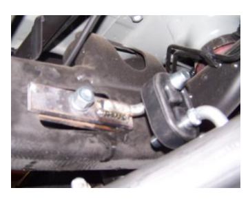
6. Install the driver side rear tailpipe hanger #H. Place the brace on the inside of the frame and the hanger portion on the outside of the frame Secure with supplied bolt kit.

5. Slide the passenger side over axle tailpipe #C into the muffler 1.5-2". Use clamp #G to secure tailpipe to muffler. Do not tighten. Insert welded hanger into rubber grommet.