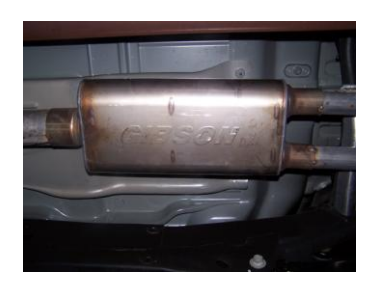
4. Slide muffler #B onto headpipe 1.5-2". Use a jack stand to support the muffler. Use clamp #F to secure the muffler to the headpipe. Do not tighten.