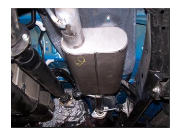
3. Install muffler #B onto head pipe 1½"-2" with the louvers facing towards the converter. Use a jack stand to support the muffler. Use clamp #F to secure the muffler to the headpipe. DO NOT TIGHTEN.