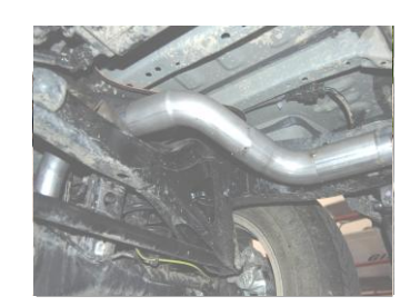
5. Next, install the exit pipe #D. onto overaxle pipe. Use clamp #F to secure to the tailpipes. DO NOT TIGHTEN. Insert welded hanger into rubber grommet.