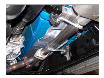
2. Install head pipe #A onto your existing stock front pipe and attach with hardware kit #G. DO NOT TIGHTEN. Insert welded hangers into rubber grommets.

4. Install the overaxle tailpipe #C into the muffler 1½-2" secure with clamp #F. DO NOT TIGHTEN. Insert welded hanger into rubber grommet.