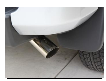
6. Install stainless steel tip #E. Clamp down. When you have everything in place, firmly tighten all bolts and clamps down securely. Use stainless steel cleaner and a Scotch Brite pad weekly to prevent tip from discoloration.

GIBSON EXHAUST systems are designed on a factory stock vehicle. Any aftermarket products installed could increase the sound levels of this Exhaust. Make sure there is a 1" clearance from ALL rubber brake lines, shock boots, fuel lines, tires, etc to prevent heat related damage or fire.