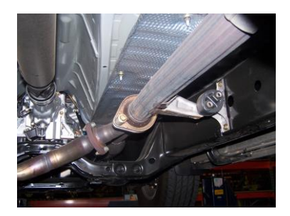
2. To remove the stock exhaust, unbolt the 2-bolt flange just in front of the muffler. Then cut your tailpipe off behind the muffler. Leave all rubber grommets on the factory hangers on the vehicle.

1. Disconnect the negative battery cable before removal of OEM exhaust. This will allow the computer to reset and recognize the new exhaust. Lay out the exhaust on the floor so it looks like the drawing and compare parts with manual.