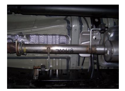
3. Install headpipe #A onto your existing stock 2-bolt flange. Use bolt kit #G to secure. Do not tighten. Insert welded hangers into rubber grommets.

5. Install the over axle tailpipe #C into the muffler 1.5-2". Secure to the muffler using clamp #F. Do not tighten. Insert welded hanger into rubber grommet.