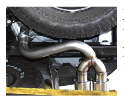
7. Install the exit pipe #D onto the tailpipe. Secure together with clamp #F. Do not tighten. Roll the exit pipe until it is at the correct angle for your vehicle. Insert welded hanger into rubber grommet.