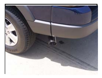
6. Install stainless steel tip #E. Clamp down. When you have everything in place, firmly tighten all bolts and clamps down securely. Use stainless steel cleaner and a Scotch Brite pad weekly to prevent tip from discoloration.

5. Next, install the exit pipes #D. Use clamp #F to secure to the tailpipe. DO NOT TIGHTEN. Insert welded hanger into rubber grommet.