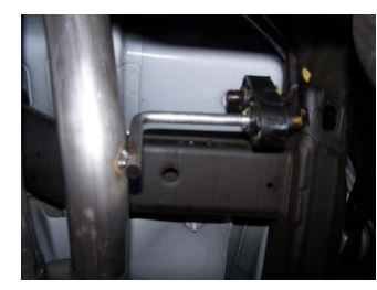
5. Install Passenger side tailpipe #D into muffler outlet 1½-2". Insert welded hangers into rubber grommet. Use clamp #F to attach to tailpipe to muffler. DO NOT TIGHTEN.

4. Install muffler #B onto head pipe #A 1\frac{1}{2} "-2". Use a jack stand to support the muffler. Use clamp #E to secure the muffler to the headpipe. Do not tighten.