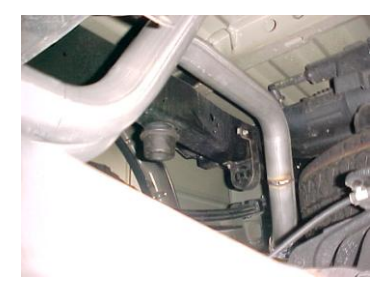
INSTALL PASSENGER SIDE TAILPIPE # C INTO MUFFLER 1\frac{1}{2} " TO 2". INSERT WELDED HANGER INTO RUBBER GROMMET, USE CLAMP # H TO SECURE PIPE TO MUFFLER. DO NOT TIGHTEN. ROTATE PIPE TOWARDS DRIVERSIDE.