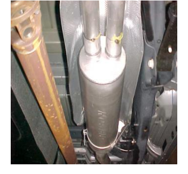
INSTALL MUFFLER # B ONTO HEADPIPE 1 \frac{1}{2} " TO 2". USE CLAMP '# G TO SECURE MUFFLER TO HEADPIPE. DO NOT TIGHTEN. USE A JACK STAND TO HOLD UP THE MUFFLER. OUTLETS SHOULD BE LEVEL.