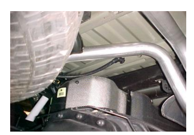
INSTALL DRIVERS SIDE TAILPIPE # D INTO MUFFLER 1 ½" TO 2". INSERT WELDED HANGERS INTO RUBBER GROMMETS. USE CLAMP # H TO SECURE PIPE TO MUFFLER, DO NOT TIGHTEN.

INSTALL HEADPIPE #A INTO STOCK PIPE. THE END OF THE PIPE SHOULD BE AT THE 12 O'CLOCK POSITION, ATTACH WITH BOLT KIT # L. DO NOT TIGHTEN. INSERT WELDED HANGER INTO RUBBER GROMMET. REMOVE THE HANGER FRO THE FRAME & RELOCATE TO THE HOLES JUST TO THE LEFT OF THE OTHER HOLES YOU WILL NEED TO PRY THE INSERTS OUT & RE-INSTALL SEE PHOTO