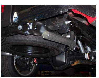
INSTALL EXIT PIPES # E ONTO TAILPIPES. ROTATE OUT TO THE SIDES; ATTACH TO TAILPIPES WITH CLAMPS # H.