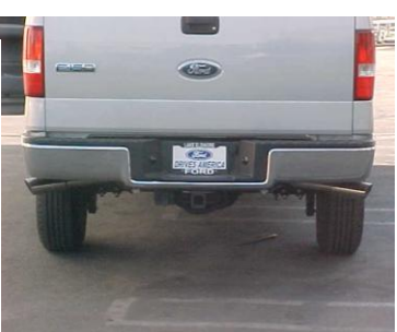
INSTALL YOUR STAINLESS TIPS TO YOUR DESIRED LOOK THEN GO BACK AND TIGHTEN ALL CLAMPS, ROTATE SYSTEM FOR BEST CLEARANCE BEFORE TIGHTENING.

MAKE SURE YOU AT LEAST A 1" CLEARANCE ON ALL BRAKE LINES, FUEL LINES, SHOCKS, TIRES, ETC. USE ZIP TIES TO TIE BRAKE LINES OUT OF THE WAY.