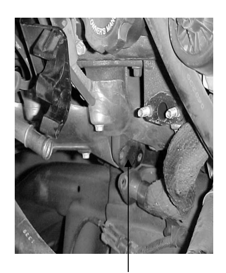
EGR TUBE FITTING