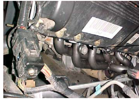
EGR PLUG IN HEADER