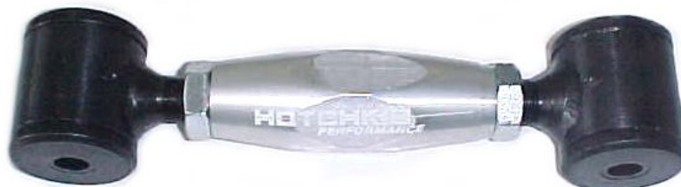
Double adjustable upper trailing arm eliminates pinion angle vibrations!

Visit Hotchkis Performance on the web at www.hotchkis.net or Call (562) 907-7757 to order!