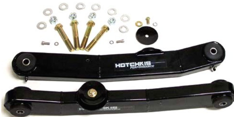
Boxed lower trailing arms to help stiffen up the rear end! Features a welded spring seat for easier spring installations!