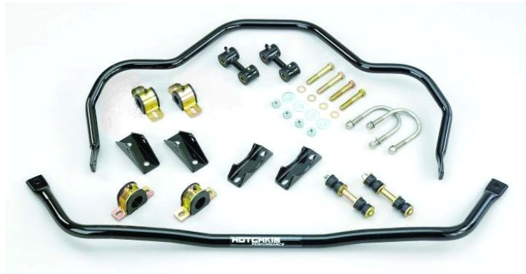
Tubular front and rear sport sway bar set!