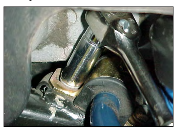
Now, remove the sub-frame hardware. Using a 16mm socket, remove the 2 bolts (1 per side) located just forward and up of the brake line and sensor - shared bracket. The other 2 (again, 1 per side) are located just inboard. You'll see one just above the stability sensor on the left upper link.