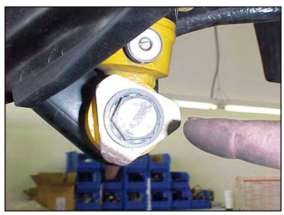
5/ Before removing the sub-frame hardware, remove the four anti roll bar bushing bracket bolts using a 13mm wrench or socket.