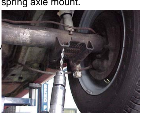
11. Install the leaf spring pads.