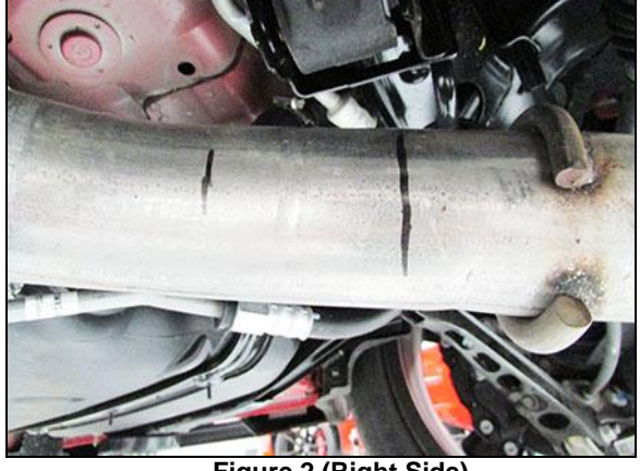
Figure 2 (Right Side)

With a permanent marker, locate the tangent line (where the bend ends and the straight section of the pipe begins) of the left side OE mid pipe and mark a straight line. Now mark another straight line exactly 2.0" after your tangent mark (2.0" in the direction of the rear of the vehicle). We suggest using masking tape to wrap around the OE mid pipe to ensure a straight cut. Draw arrows to ensure you cut at the correct side of the marking tape. DOUBLE CHECK AND MEASURE TWICE BEFORE CUTTING.