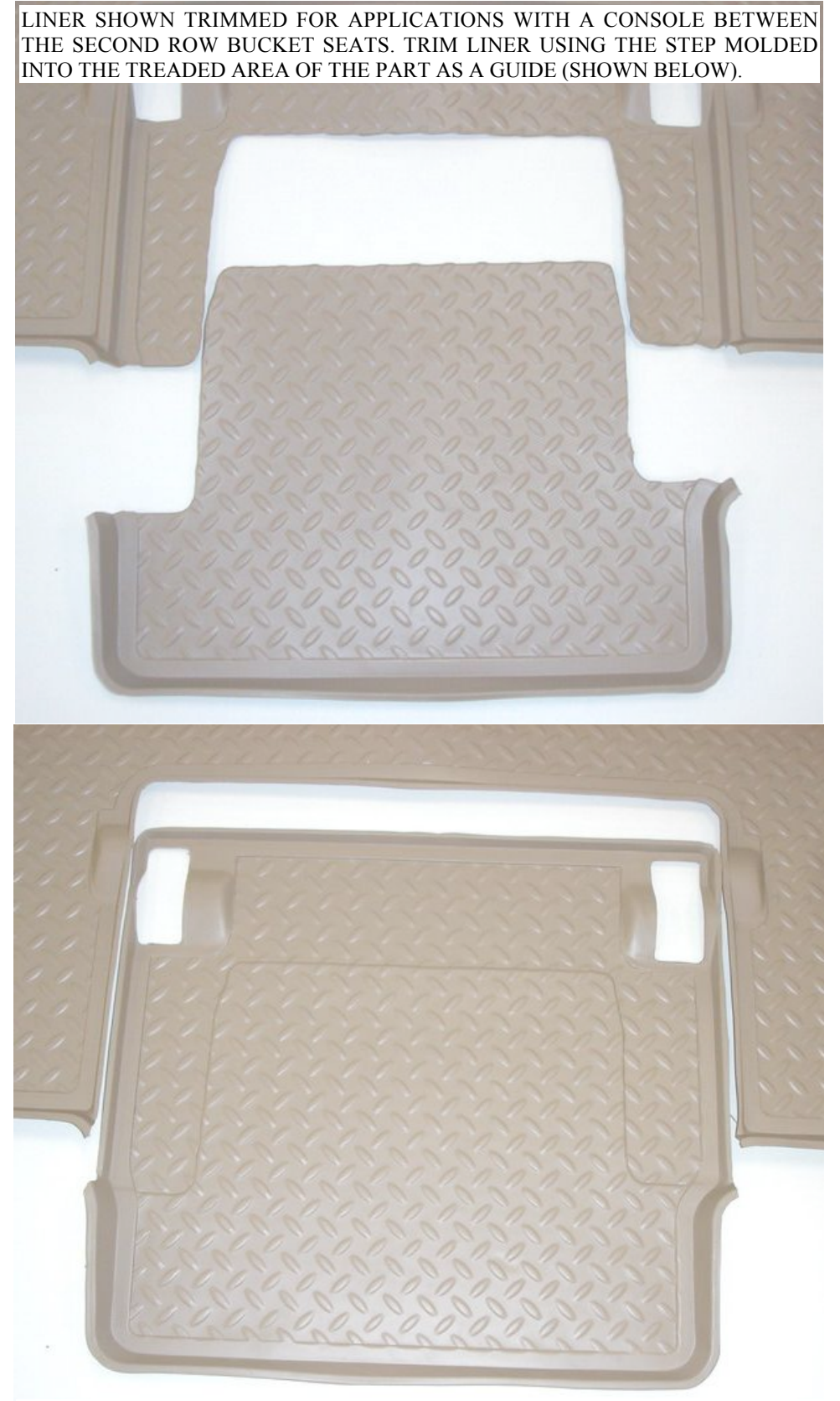
LINER SHOWN TRIMMED FOR APPLICATIONS WITH SECOND ROW BENCH SEATING. TRIM LINER FOLLOWING THE STEP MOLDED INTO THE MIDDLE OF THE RAISED "U-SHAPED" BAND ON PART AS SHOWN BELOW.

TO ACCOMMODATE THE MULTIPLE SEATING CONFIGURATIONS AVAILABLE IN THE EXPEDITION/NAVIGATOR, YOUR LINER HAS TWO TRIM AREAS. THE PHOTOS BELOW DETAIL THE TRIMMING OF THESE AREAS. A UTILITY KNIFE OR HEAVY SHEARS WORK WELL FOR TRIMMING.