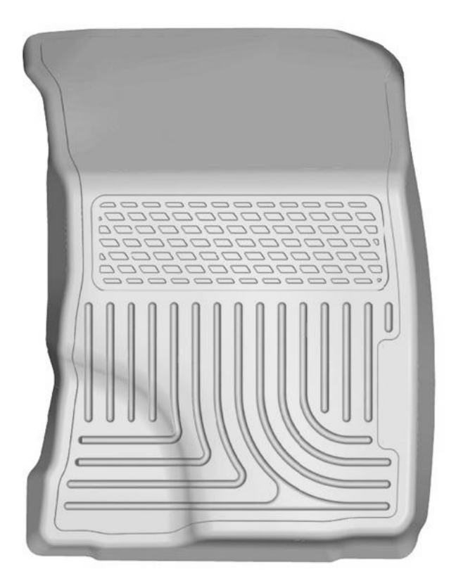
RIGHT OR PASSENEGER'S SIDE

TO EASE INSTALLATION OF YOUR CIVIC FRONT FLOOR LINERS, FIRST SLIDE BOTH FRONT ROW SEATS ALL THE WAY BACK TO EXPOSE THE FRONT FLOOR PANS. ONCE YOU HAVE INSTALLED THE FRONT LINERS, REPOSITION THE FRONT SEATS AS DESIRED.