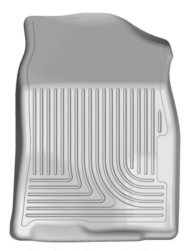
RIGHT OR PASSENEGER'S SIDE

TO EASE INSTALLATION OF YOUR CIVIC FRONT FLOOR LINERS, FIRST SLIDE BOTH FRONT ROW SEATS BACK TO EXPOSE THE FRONT FLOOR PANS. INSTALL LINERS TAKING CARE TO ATTACH THE DRIVER'S SIDE LINER TO THE FACTORY TWIST-LOCK RETAINERS. ONCE YOU HAVE INSTALLED THE FRONT LINERS, REPOSITION THE FRONT SEATS AS DESIRED.