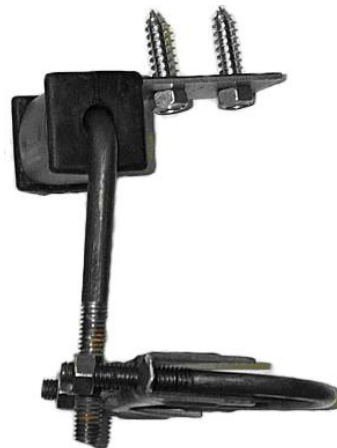
Front tail pipe hanger assembly