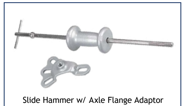
Slide Hammer w/ Axle Flange Adaptor