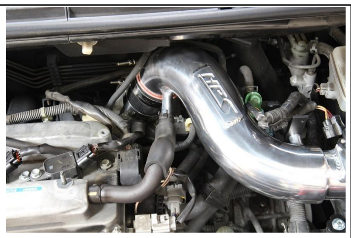
26. Reinstall the breather hose onto the intake pipe.