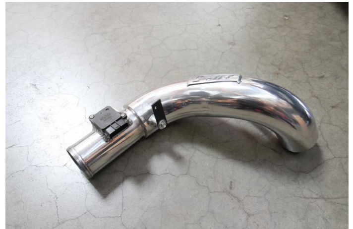
24. Remove the MAF sensor from the factory air box and install the MAF sensor onto the intake pipe using the provided Allen bolts.