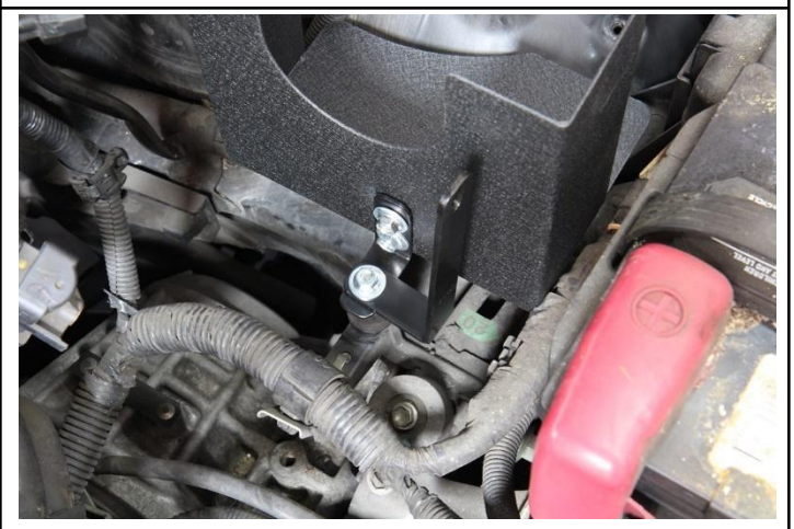
22. Loosely install the short ram intake bracket on top of the heat shield bracket using a washer and nut supplied in your hardware kit.