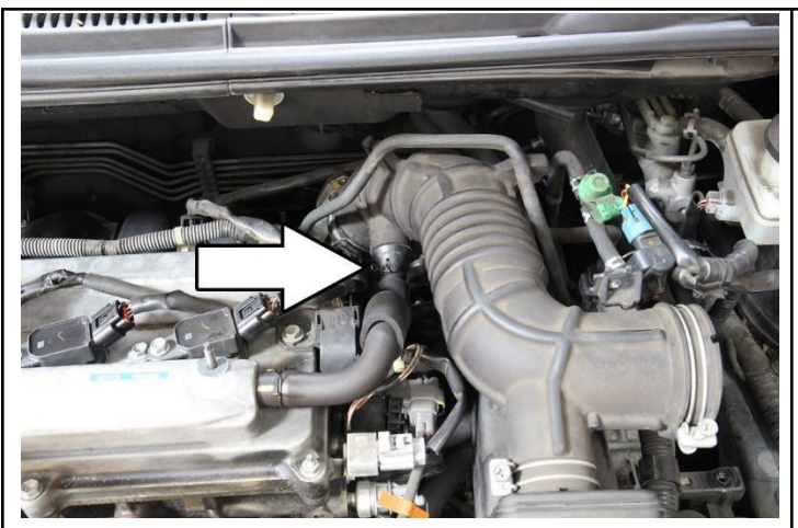
13. Disconnect the breather hose from the intake tube.