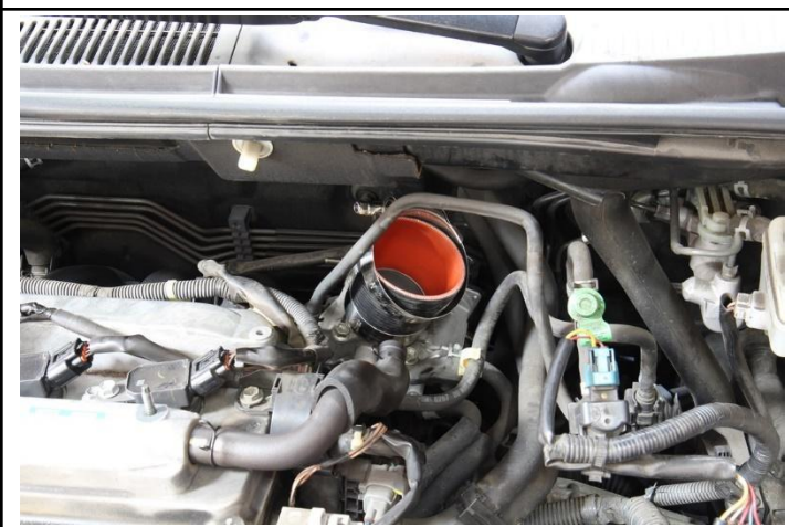
16. Install the reducer coupler along with the provided T-bolt clamps onto the throttle body.