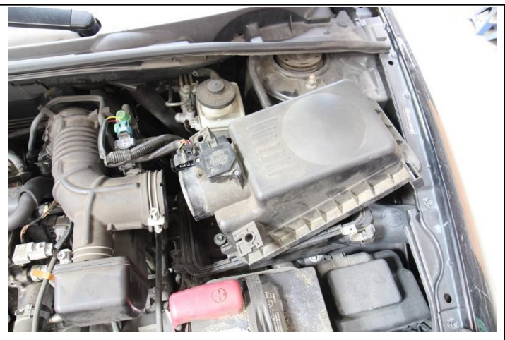
5. Remove the upper air box lid and the air filter from the vehicle.