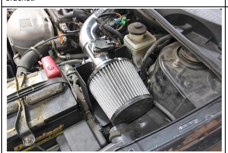
29. Install the provided HPS performance air filter.