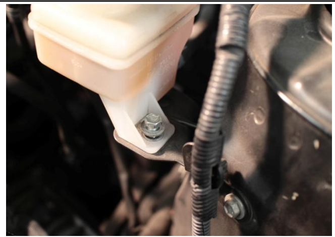
18. Loosen and remove the bolt from the brake fluid reservoir.