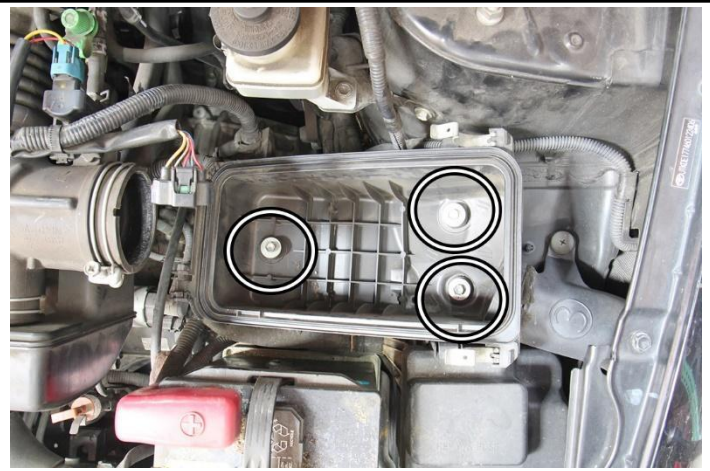
6. Remove the three 10mm bolts securing the lower air box assembly.