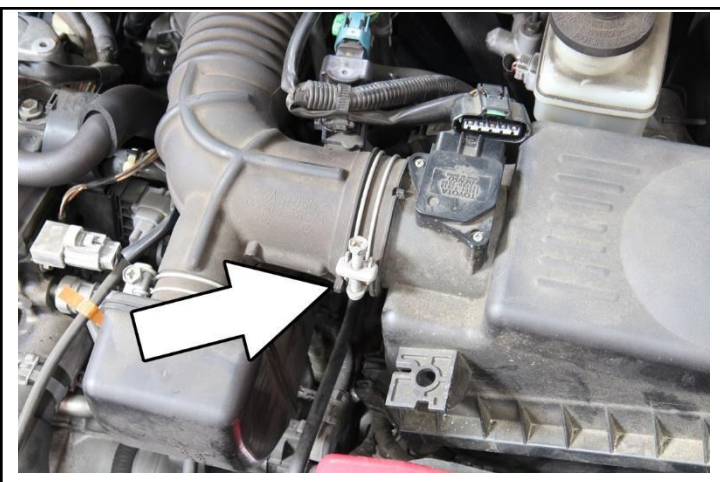
4. Using a 10mm socket, loosen the hose clamp securing the intake tube from the air box assembly.