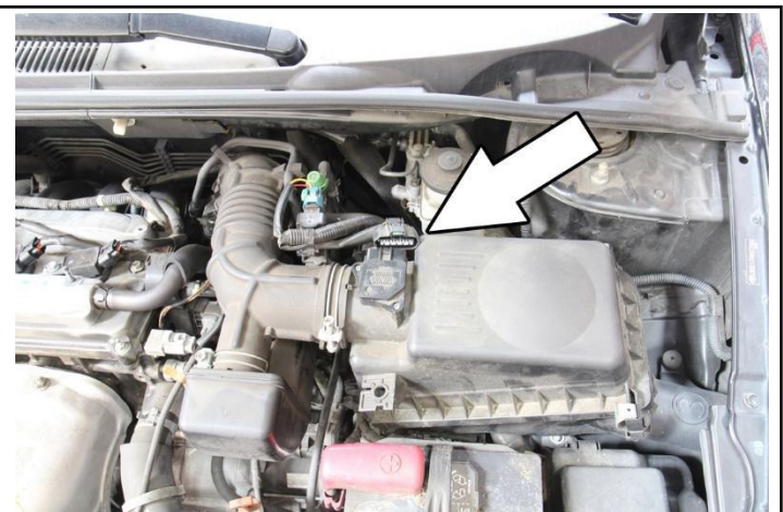
3. Disconnect the mass air flow sensor harness connector from the sensor.