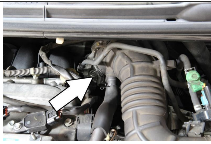
14. Loosen the spring clamp securing the intake tube from the throttle body using a pair of pliers.