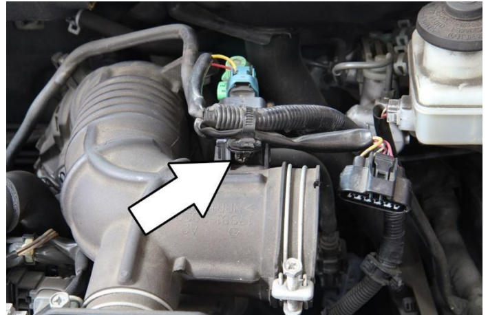
12. Remove the Evaporative sensor from the intake tube using a Phillips head screwdriver.