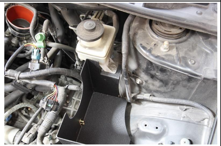
21. Reinstall the factory bolt securing the brake fluid reservoir.