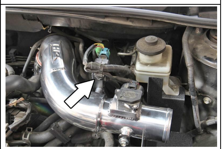
28. Clip the MAF sensor harness clip back onto the bracket.