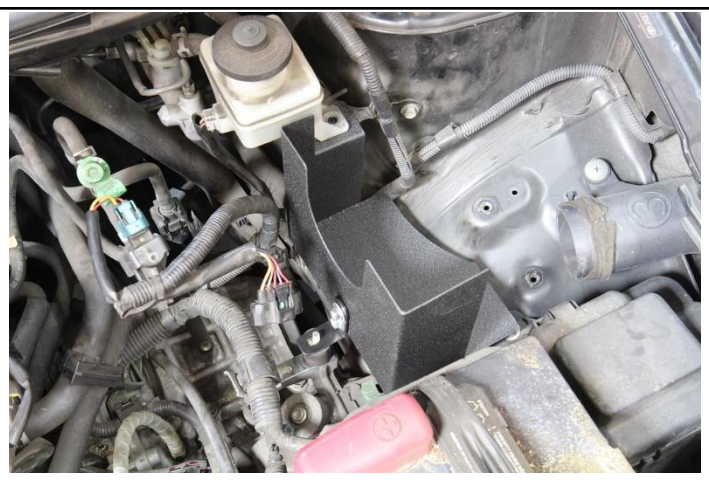
20. Slide the heat shield underneath the brake fluid reservoir and onto the vibration mount.