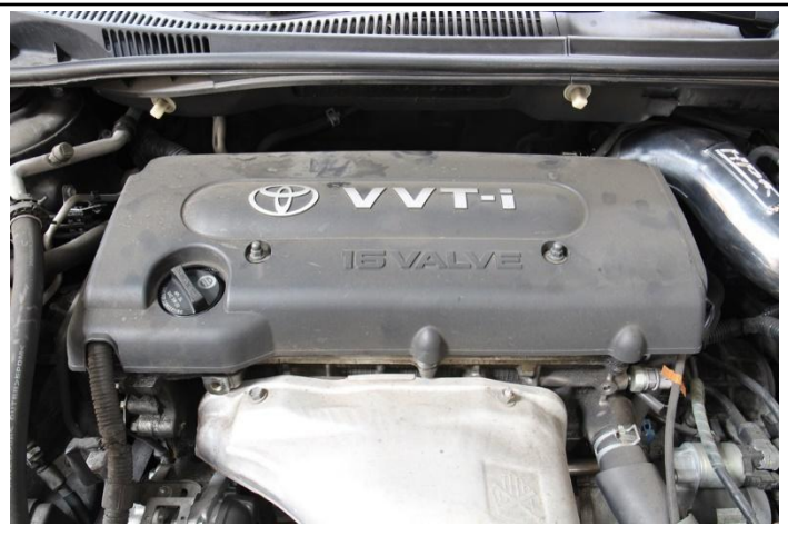
30. Reinstall the engine cover back onto the vehicle.