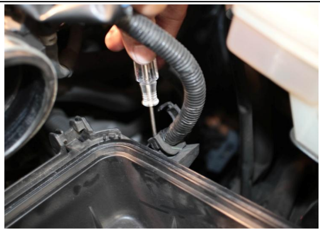
10. Unclip the MAF harness from the lower air box and remove the lower air box from the vehicle. Use a pick or a small flat screwdriver to release the clip.