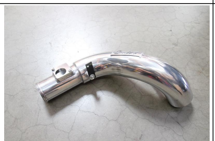
23. Install and secure the sensor bracket onto the intake using a washer and M6 bolt.