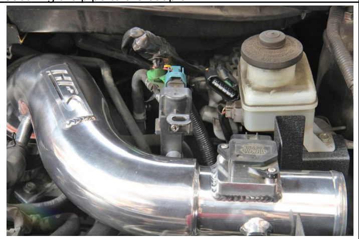
27. Reuse the factory screw to reinstall the EVAP sensor onto the sensor bracket along with the factory harness bracket.