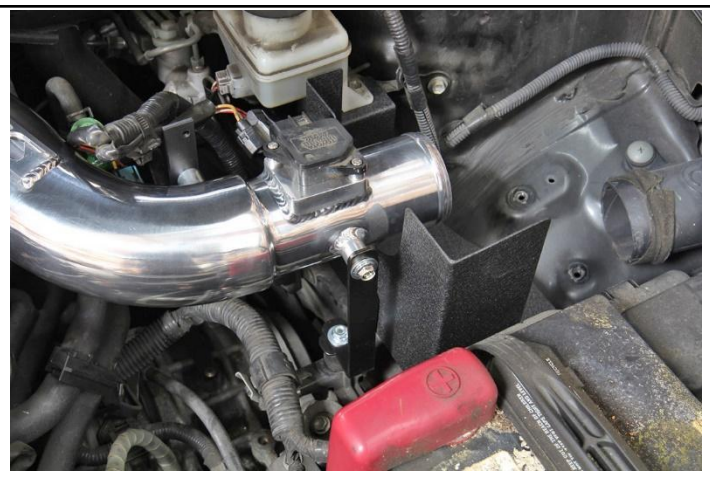
25. Insert the intake pipe into the coupler and secure the intake pipe onto the intake bracket. Once the intake pipe is in its proper position, you can tighten the T-bolt clamp securing the pipe to the coupler.