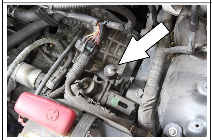
17. Install the provided 1" inch vibration onto the lower air box mounting bracket.