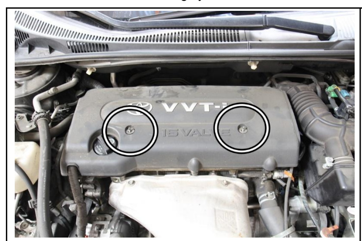
2. Remove the two 10mm bolts securing the engine cover and remove the cover from the vehicle.

NOTE: Disconnecting the negative battery cable erases pre-programmed electronic memories. Write down all memory settings before disconnecting the negative battery cable. Some radios will require an anti-theft code to be entered after the battery is reconnected. The anti-theft code is typically supplied with your owner's manual. In the event your vehicles' anti-theft code cannot be recovered, contact an authorized dealership to obtain your vehicles anti-theft code. We also highly recommend NOT discarding any stock parts after the installation.