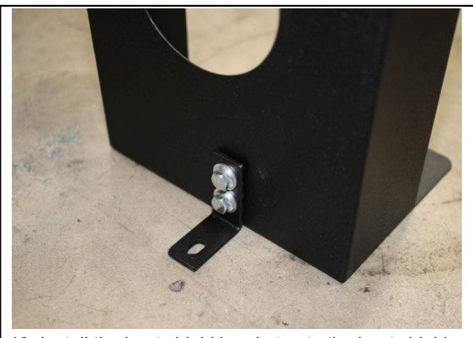
19. Install the heat shield bracket onto the heat shield using the two M6 bolts and washers included in the hardware kit.