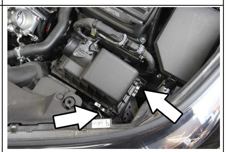
7. Unclip the retaining clips securing the upper air box from the lower air box assembly.