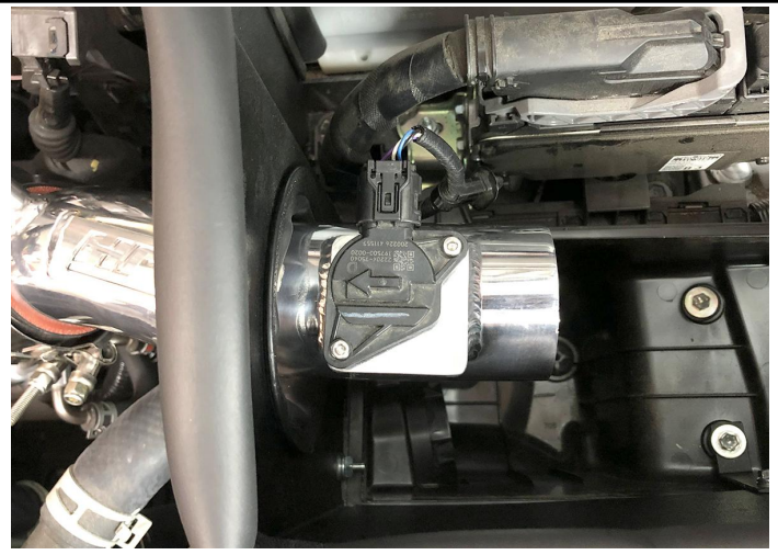
18. Transfer the MAF sensor from the stock air box onto the HPS intake pipe and secure it with the provided M4 screws. Reconnect the electrical connection.