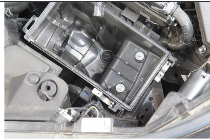
11. Install the "L" bracket onto the stock air box mount and secure the bracket reusing the bolt removed from the previous step.