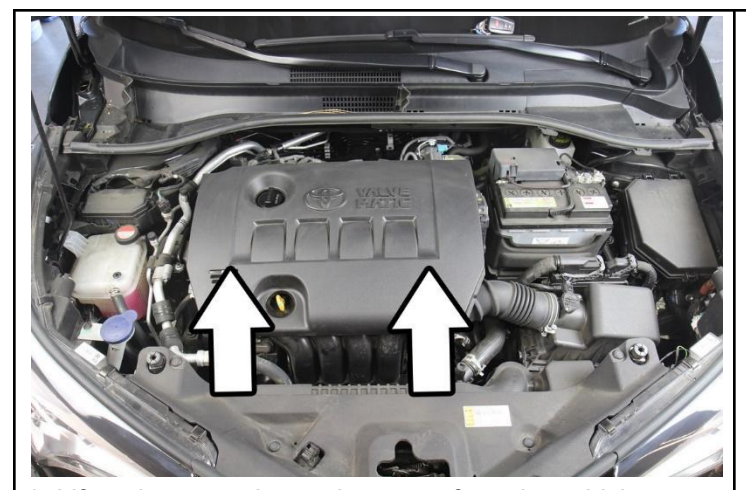
2. Lift and remove the engine cover from the vehicle.

NOTE: Disconnecting the negative battery cable erases pre-programmed electronic memories. Write down all memory settings before disconnecting the negative battery cable. Some radios will require an anti-theft code to be entered after the battery is reconnected. The anti-theft code is typically supplied with your owner's manual. In the event your vehicles' anti-theft code cannot be recovered, contact an authorized dealership to obtain your vehicle's anti-theft code. We also highly recommend NOT discarding any stock parts after the installation.