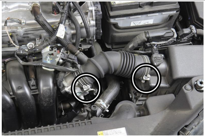
3. Loosen the hose clamps securing the intake tube from the air box and the throttle body.