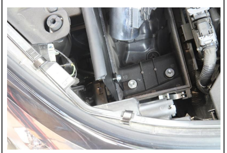
16. Locate the 6mm x 16 bolt, washer, nut, and spacer. Place the spacer between the bracket and the heat-shield and secure the bracket onto the heat-shield.