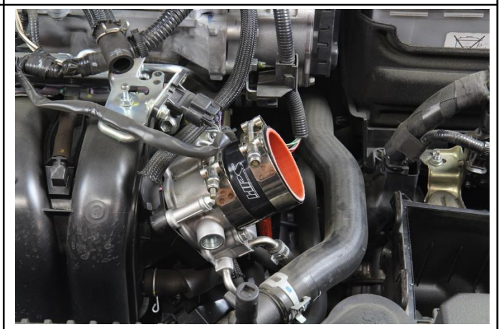
9. Insert the provided silicone coupler along with the T-bolt clamps onto the throttle body.