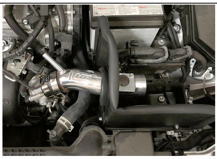
17. Insert the HPS intake pipe through the opening in the heat shield, then slide the pipe in onto the silicone coupler.