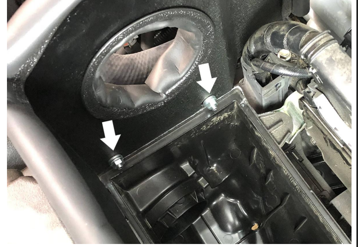
15. On the opposite side of the heat shield, install a nut and washer to secure the heat shield in place.