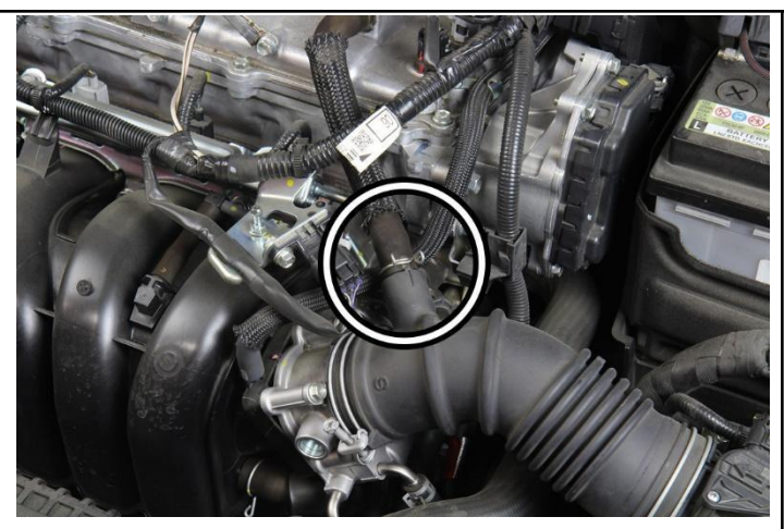
4. Depress the spring clamp and remove the breather hose from the intake tube.