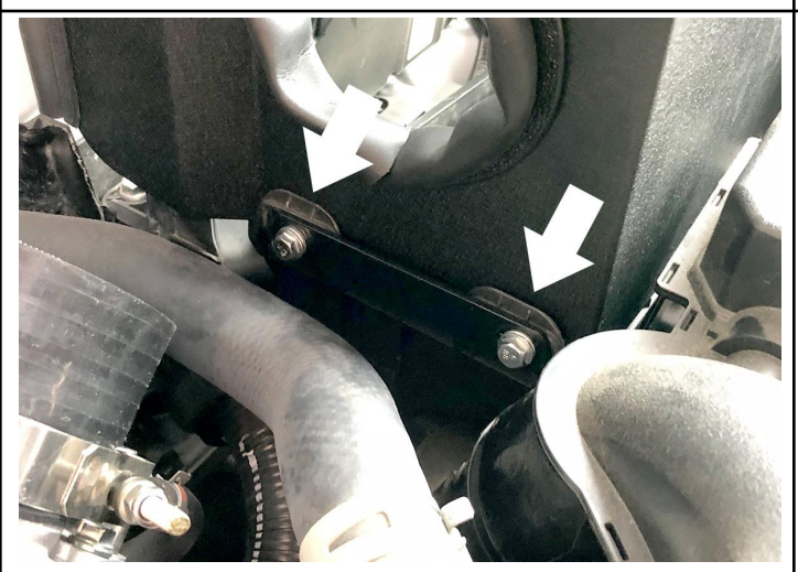
14. Place the flat bracket in front of the ears, then slide in the long bolts along with a washer through the hole.