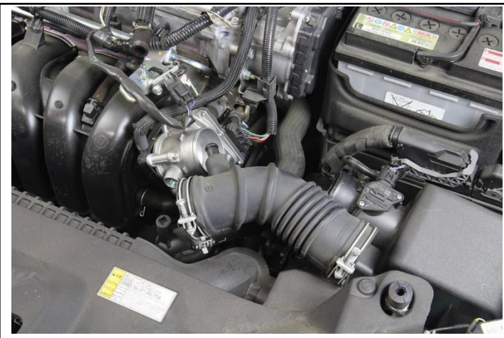
5. Remove the stock intake tube from the vehicle.