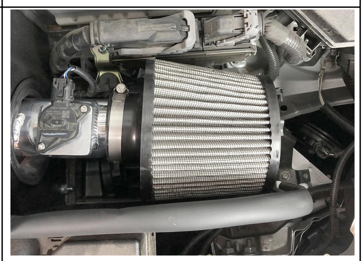
19. Install and fasten the air filter onto the pipe.