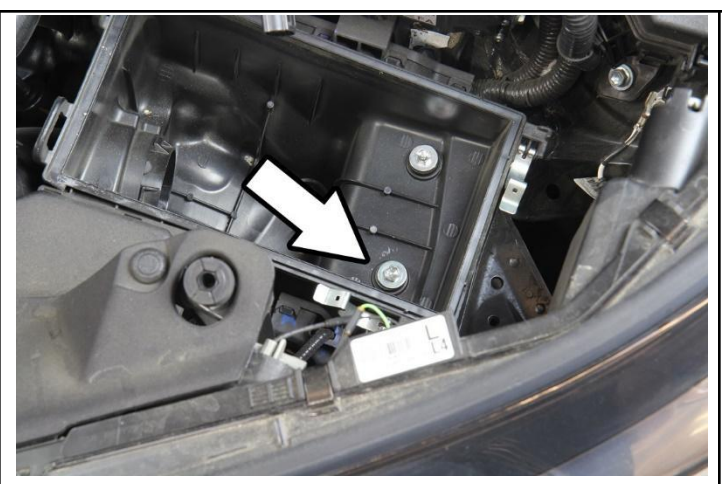
10. Remove the 10mm bolt securing the lower air box shown in the image above.