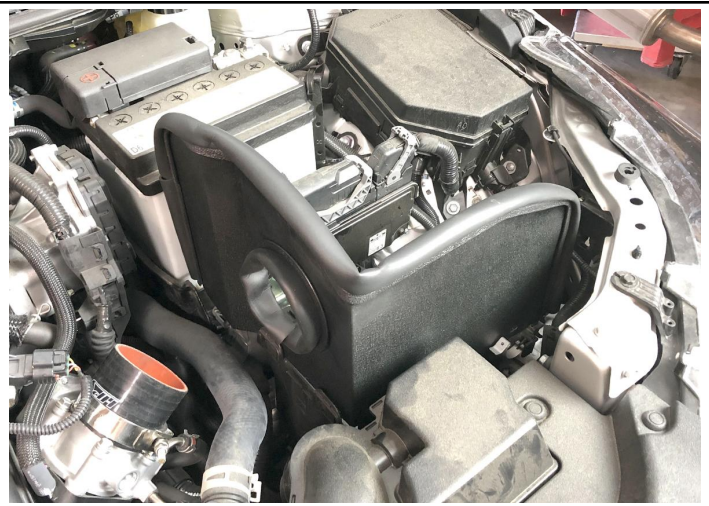
13. Place the heat shield on top of the stock lower air box. Be sure that the heat shield sits to the right of the ears.