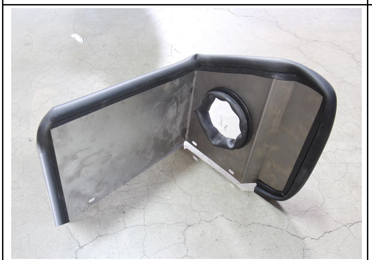
12. Install the provided bubble edge trims onto the heat-shield in the areas shown above.