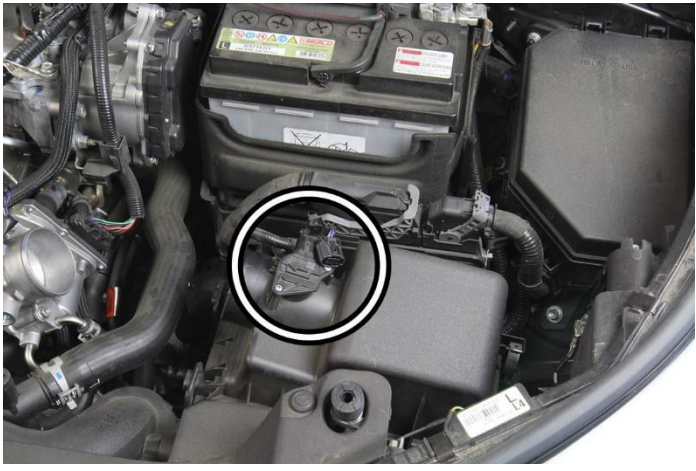
6. Disconnect the Mass Air Flow sensor connector from the MAF sensor.