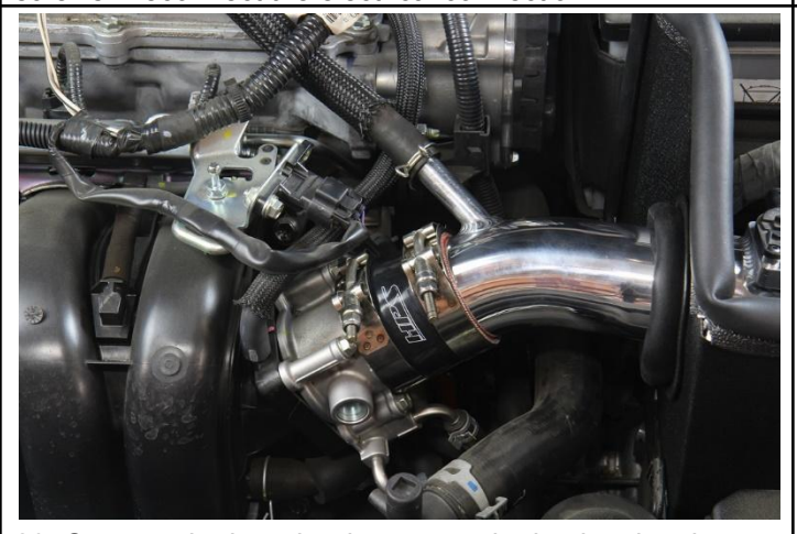
20. Connect the breather hose onto the intake pipe then adjust the position of the pipe.