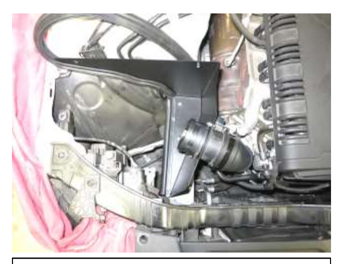
b. Lower the assembly into the vehicle being careful to orient the hose clamps such that they can be accessed by tools to be tightened.