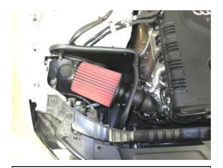
d. Install the air filter. If an open element kit is desired, the edge trim can be installed around the lower heat shield edge as shown above. For better performance via colder air supply, add the upper heat shield/duct and hardware according the graphic on page 2 of this document continuing the edge trim along the edge of the upper heat shield as shown in step f (next page).