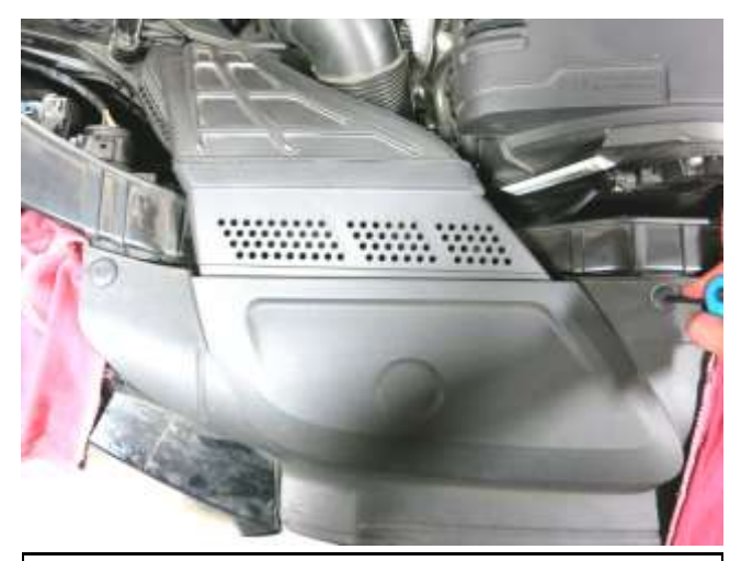
a. Use small pointed tool to depress & release the two left-most pins holding down the radiator top panel.