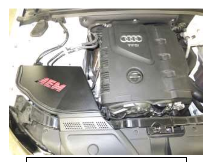
f. Finished installation of AEM Intake System.