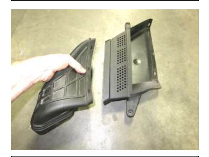
i. Disassemble the dirty air duct assembly by squeezing as shown.