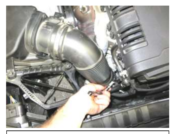
e. Disconnect MAF sensor and loosen the clamp securing the factory clean-air duct to the turbocharger.