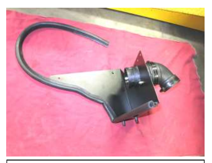
a. Assemble the lower heat shield components as shown according to the graphic on page 2 of this document leaving the edge trim loose at the upper left corner.

a. When installing the intake system, do not completely tighten the hose clamps or mounting hardware until instructed to do so.