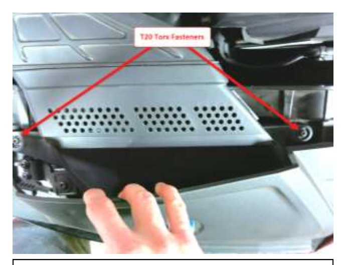
b. Pry back the panel to reveal and remove the Torx bits securing the factory dirty air duct assembly.