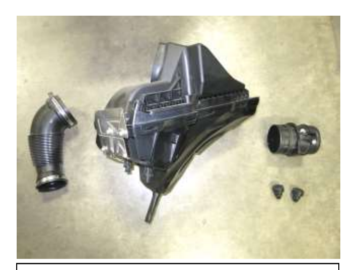
h. Use the Torx tool to separate the MAF sensor housing from the factory airbox. If the rubber feet shown in the lower right in the picture above came out of the vehicle with the airbox, put them back in their holes in the chassis rail.