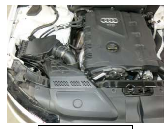
e. Factory air induction system.