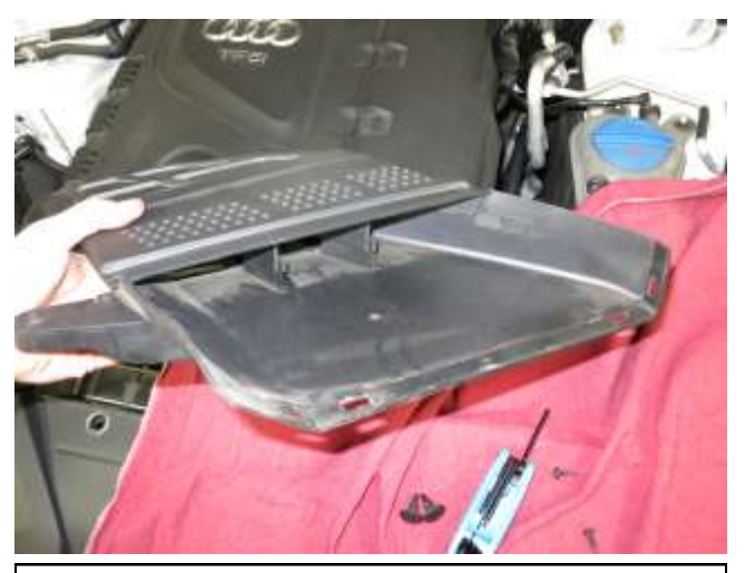
d. Remove the pre-filter from the opposite end of the duct assembly as shown.