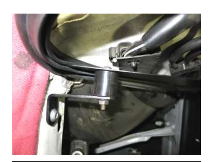
c. Install the included bracket and soft-mount using the factory bolt as shown.