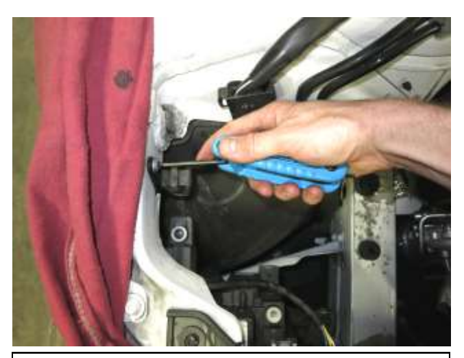
g. Use the Torx tool to remove the factory airbox mount bracket. The bolt will be re-used.