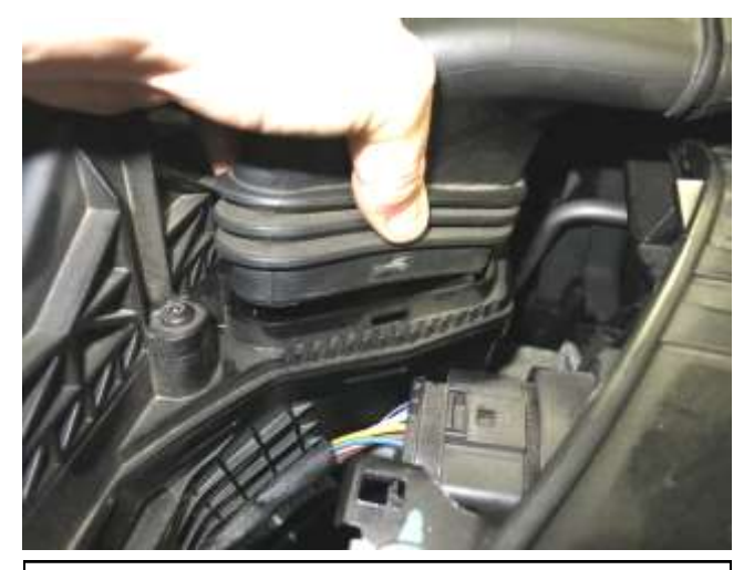
c. Squeeze the lower-most end of the dirty air duct assembly to release and remove it from the factory airbox.