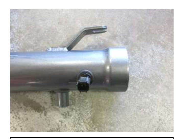
c. Install the air temperature sensor that was removed in step 2i. into the grommet.