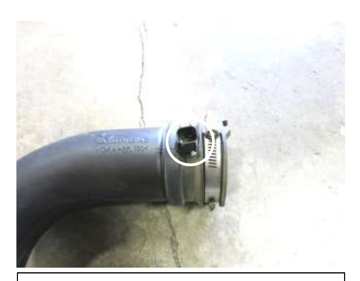
i. Remove the air temperature sensor from the stock intake tube. This will be reused in step 3c.