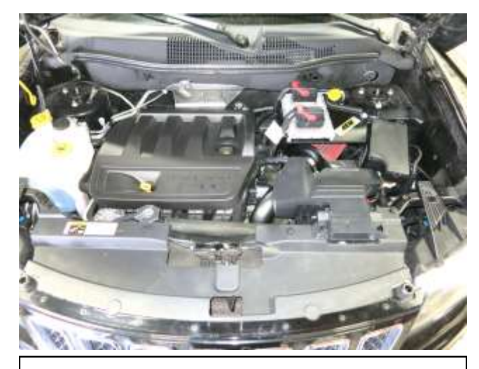
AEM INTAKE INSTALLED