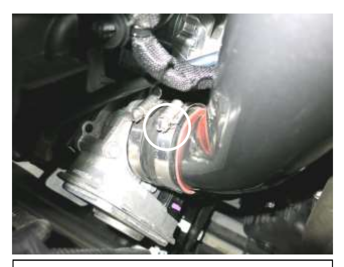
k. With the AEM intake tube aligned in the hose, tighten the hose clamp circled.