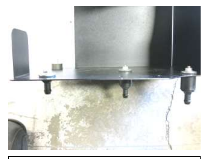
d. Install the provided hardware onto the AEM heat shield. Refer to the exploded view for hardware orientation.