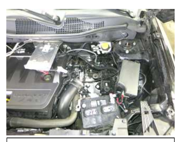
g. Remove the stock air box from the vehicle. Note: Do not discard any of your stock equipment.