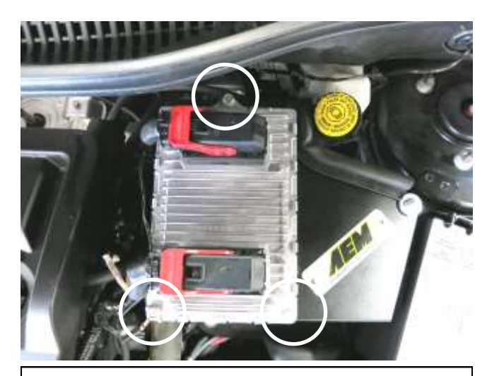
h. Place the ECU onto the heat shield and install the three bolts that were removed in step 2c. Note: Make sure to connect the ground strap.