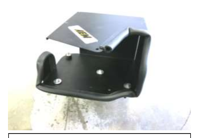
e. Install the provided edge trim as shown. Note: You may need to cut trim to length.