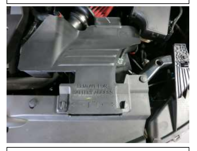
p. Install the fresh air scoop back onto the vehicle that was removed in step 2a.