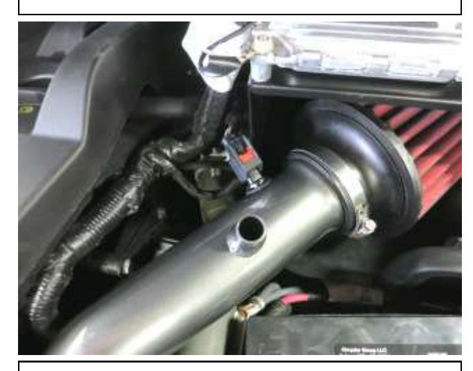
n. Plug the air temperature sensor connector into the air temperature sensor and lock the red locking tab.