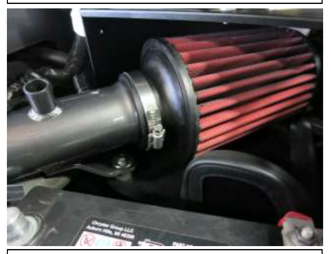
m. Install the AEM air filter onto the AEM tube and tighten the hose clamp.