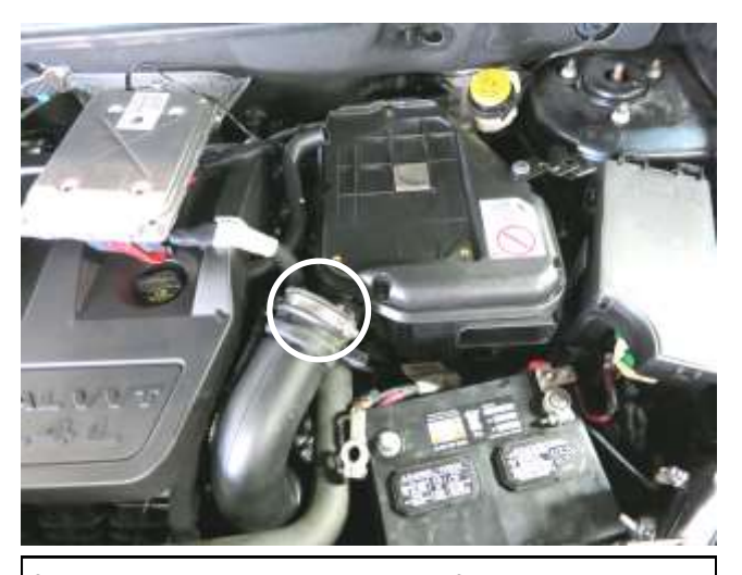
f. Disconnect the stock intake tube from the stock air box.