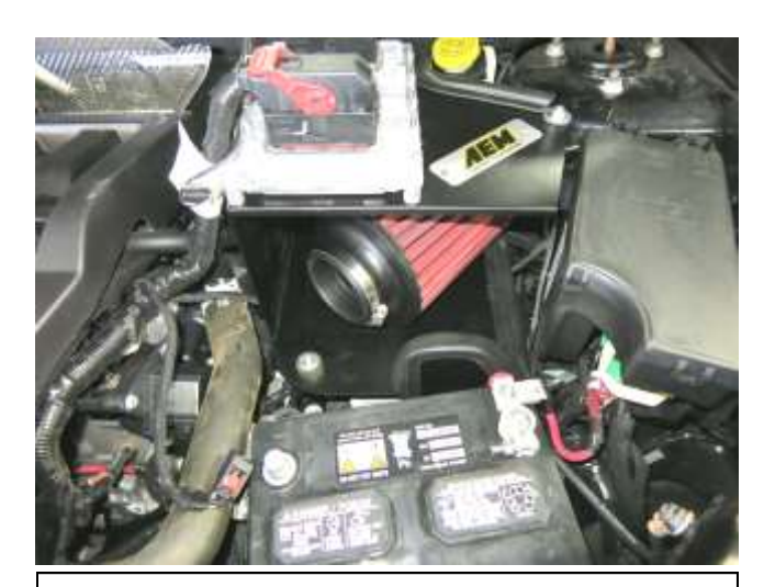
i. Place the AEM air filter with the hose clamp into the heat shield at this time.