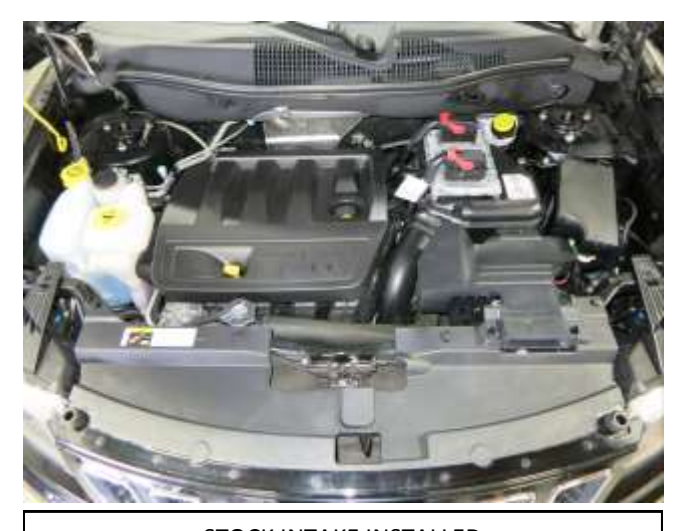
STOCK INTAKE INSTALLED