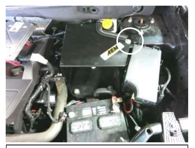
g. Install the assembled heat shield into the vehicle aligning the mounts in the heat shield with the grommets in the vehicle. Align the heat shield with the rubber mount circled and tighten with supplied hardware.