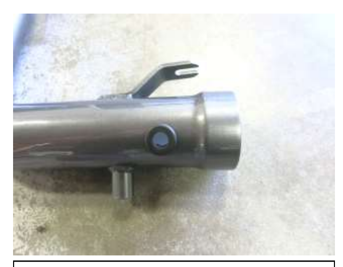
b. Install the provided grommet into the hole on the AEM intake tube.