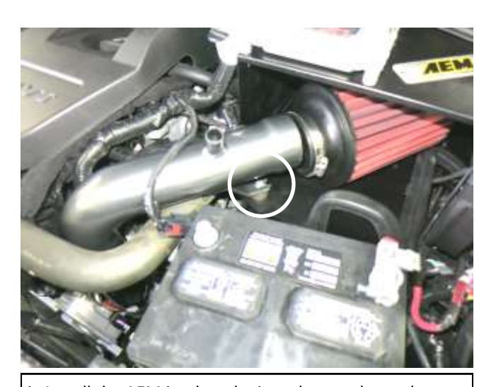
j. Install the AEM intake tube into the coupler at the throttle body and align the bracket with the rubber mount.