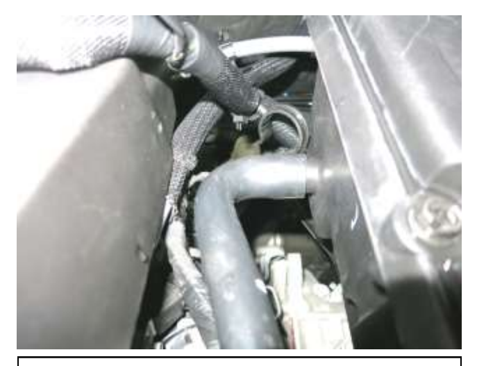
e. Remove the vent hose on the side of the stock air box. This will be reattached in step 3o.