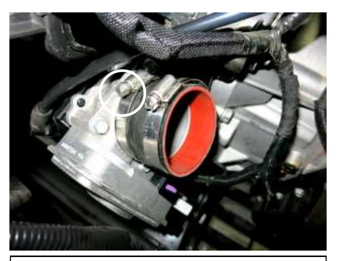
a. Install the provided hose and hose clamps onto the throttle body. Tighten the hose clamp closest to the throttle body at this time.

a. When installing the intake system, do not completely tighten the hose clamps or mounting hardware until instructed to do so.