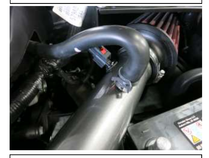
o. Install the vent tube that was removed in step 2e. onto the AEM intake tube with the provided spring clamp.