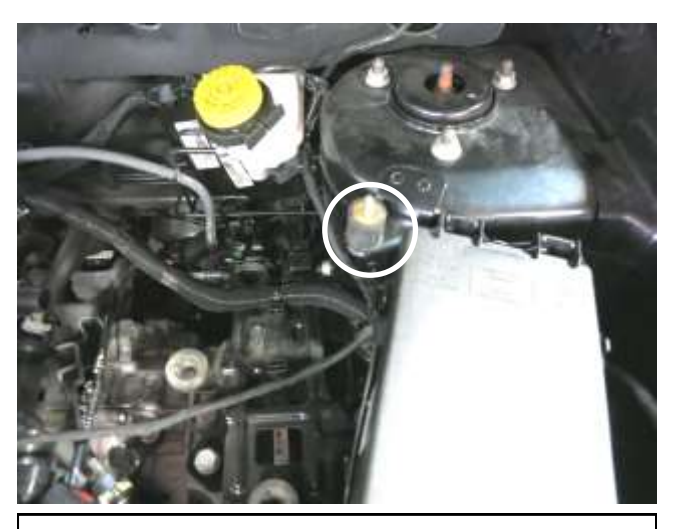
f. Install the rubber mounted stud onto the inner fender as shown.