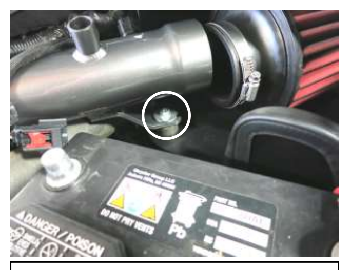
I. Install the provided hardware and secure the AEM intake tube to the rubber mount.