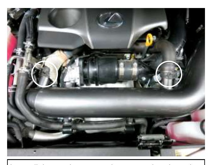
I. Install the vent hoses onto the AEM intake tube and secure with the spring clamps removed in step 2b.