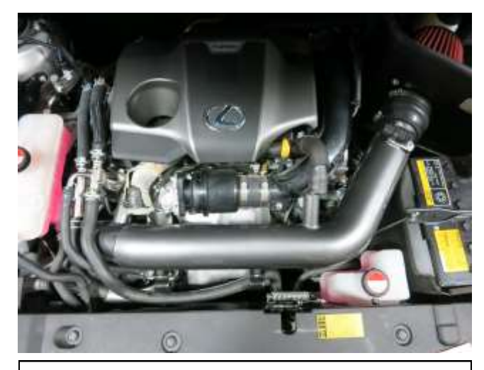
k. Install the AEM intake tube into the vehicle aligning the tube with the previously installed hoses.