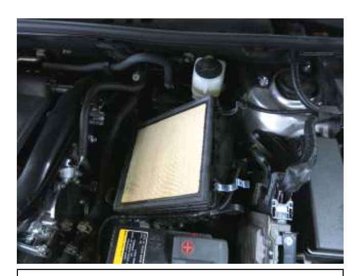
j. Remove the stock air filter from the lower air box.