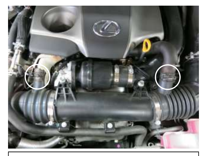
b. Squeeze to loosen the spring clamps and disconnect the vent hoses from the stock intake tube.