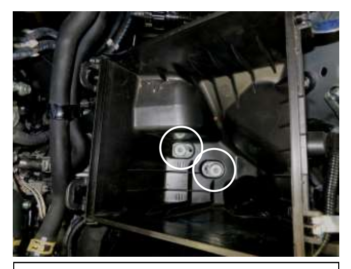
k. Remove the two bolts securing the lower air box to the vehicle. One bolt will be reused in step 3s.