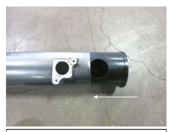
a. Install the venturi into the AEM intake tube, be sure the two openings are aligned.

a. When installing the intake system, do not completely tighten the hose clamps or mounting hardware until instructed to do so.