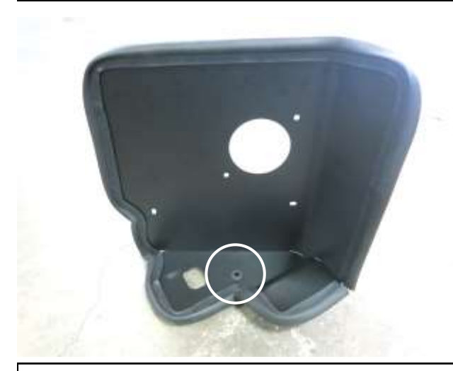
d. Install the edge trim as shown around the AEM heat shield, trim off excess if necessary. Then, install the provided grommet into the hole shown.