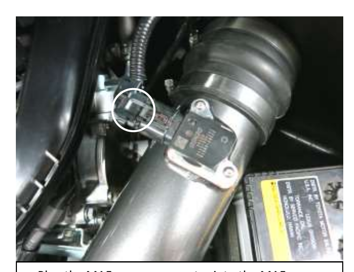
n. Plug the MAF sensor connecter into the MAF sensor.