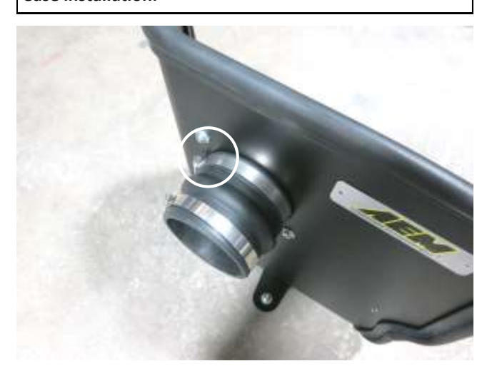
g. Install the hump hose onto the adapter with the provided hose clamps. Tighten the hose clamp closest to the heat shield at this time.