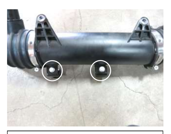
p. Remove the two bolts and stand offs. These will be reused in step 3c.