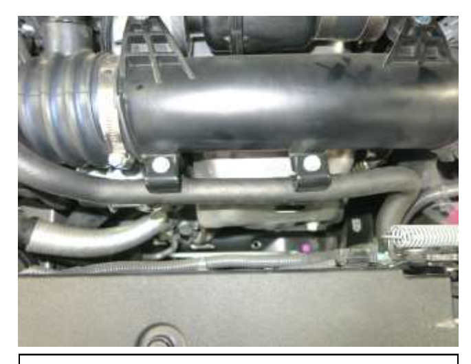
e. Slide the hose out of the clips that hold it on the stock intake tube.