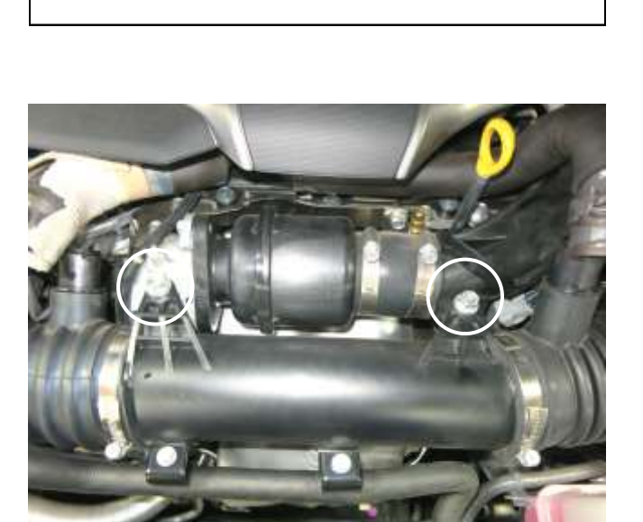
c. Loosen and remove the two bolts securing the stock intake tube to the vehicle.