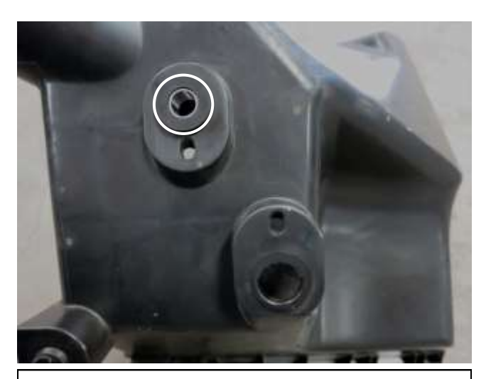
n. Turn the lower air box over and remove one of the metal sleeves and rubber grommet. The metal sleeve will be reused in step 3E.