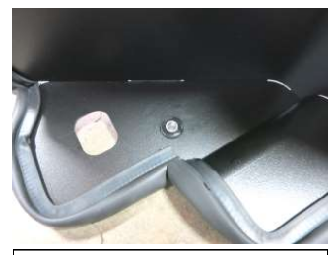
e. Take the sleeve that was removed in step 2n and install it into the grommet. Note: A little soapy water will ease installation.