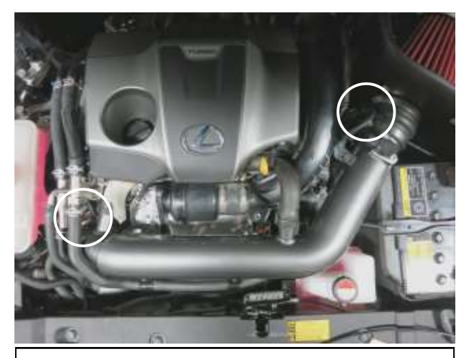
m. Tighten the hose clamps at the turbo compressor and heat shield securing the AEM intake to the hoses.