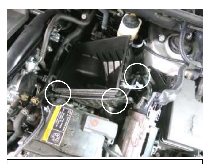
I. Maneuver the lower air box to access the three pushin wire harness clips and disconnect all of them.