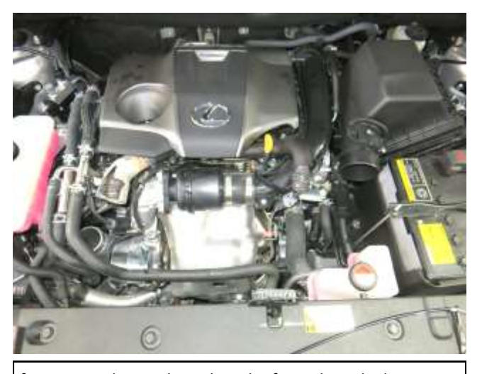
f. Remove the stock intake tube from the vehicle.