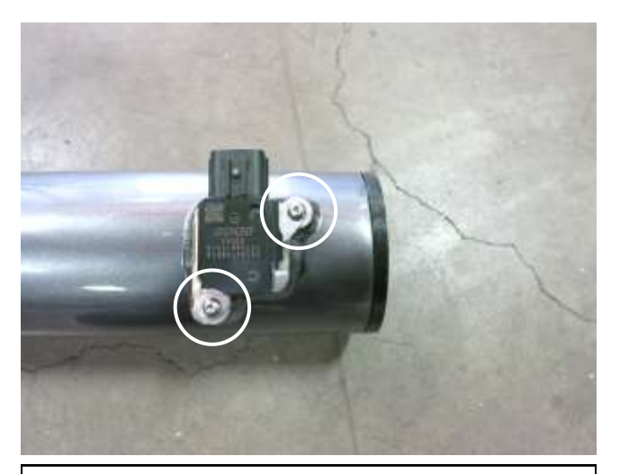
b. Install the MAF sensor into the AEM intake tube and secure with the provided hardware.