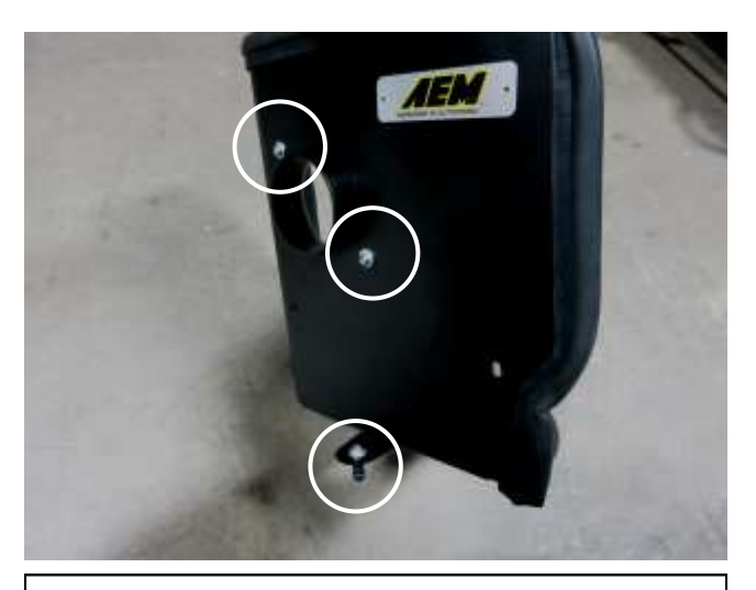
f. Assemble the adapter and air box mount with the provided hardware according to diagram on pg. 2.