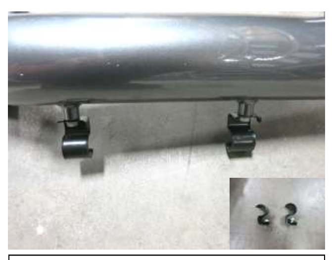
c. Take the stand-offs and bolts from step 2p. and install the bolts according to the inset picture. Then, install them onto the AEM intake tube as shown.