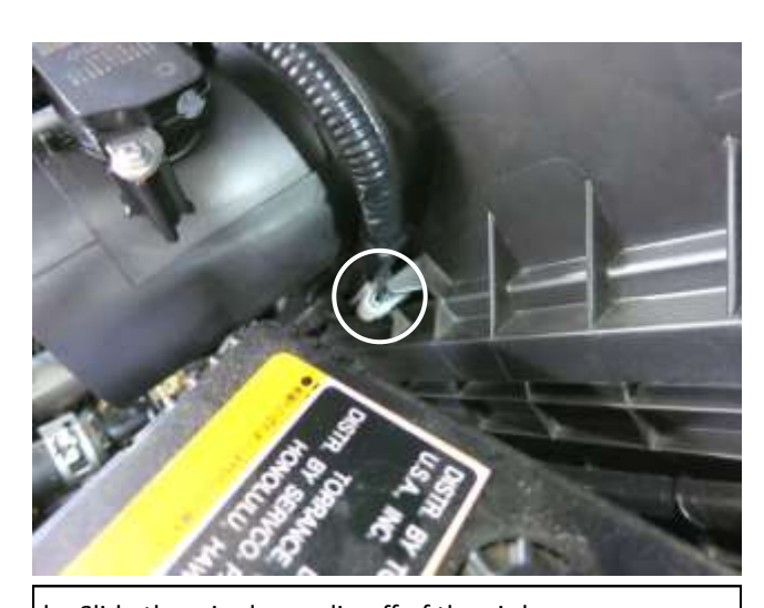
h. Slide the wire loom clip off of the air box.