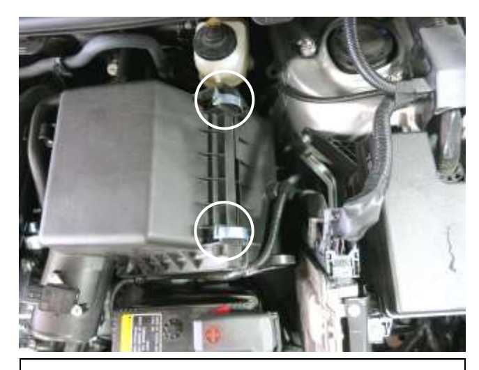
i. Unlatch the two clips that hold the upper air box to the lower air box and remove the upper air box.