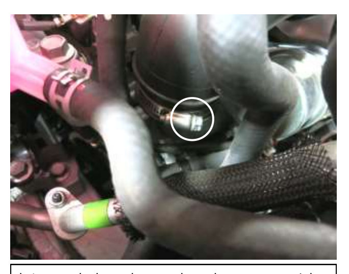
d. Loosen the hose clamp at the turbo compressor inlet.