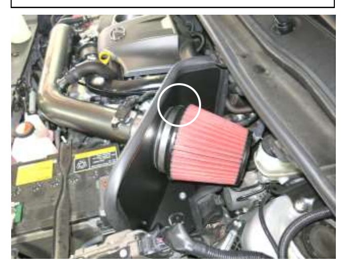
o. Install the AEM filter onto the filter adapter and tighten the hose clamp.