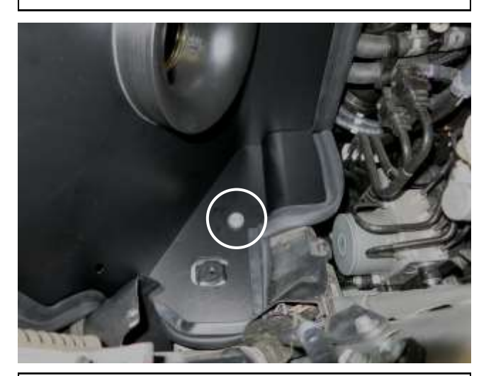
j. Align the grommet/sleeve with the mounting hole in the vehicle and use the factory bolt removed in step 2k to secure the heat shield to the vehicle.