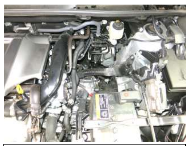
m. Remove the lower air box from the vehicle. Note: Do not discard any of your stock equipment.