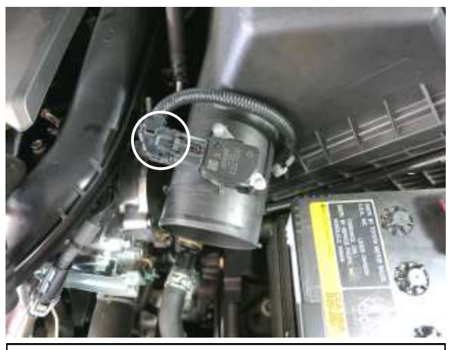
g. Depress the clip and remove the mass air flow (MAF) sensor connector from the sensor.