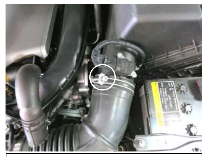
a. Loosen the hose clamp at the air box.