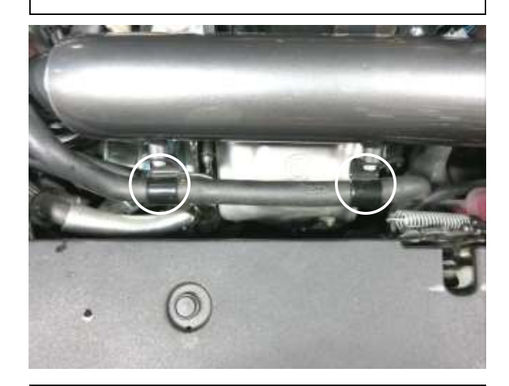
p. Place the hose back into the clips that were removed in step 2e.