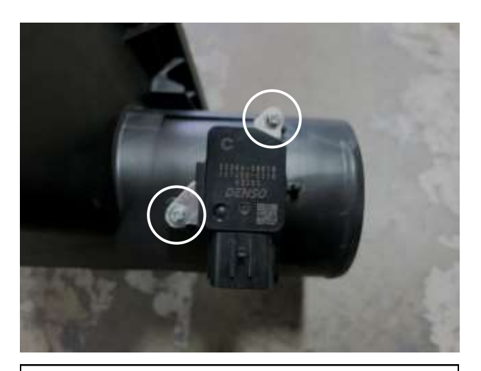
o. Remove the two screws that secure the MAF sensor to the upper air box. The MAF sensor will be reused in step 3b.