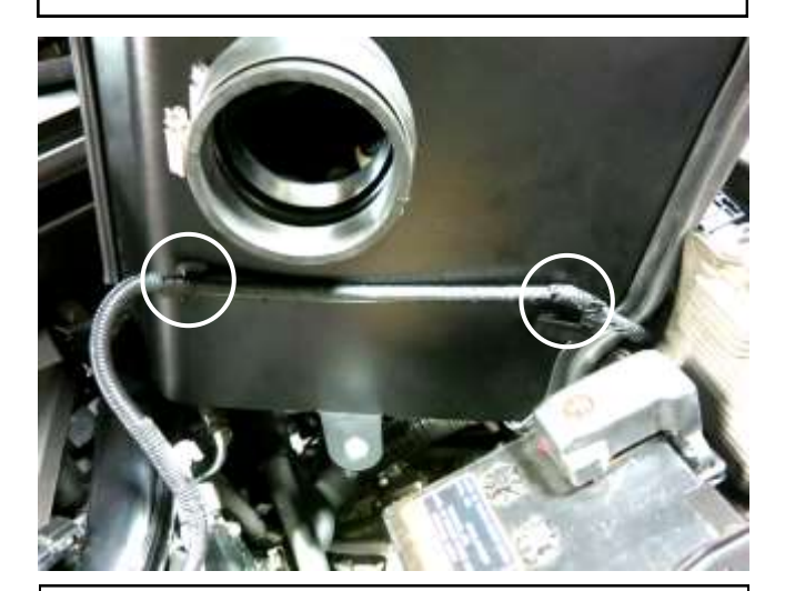
i. Secure the MAF sensor wiring harness onto the AEM heat shield via the stock clips. Then, lower the heat shield into the engine bay and press the air box mount into the stock grommet.