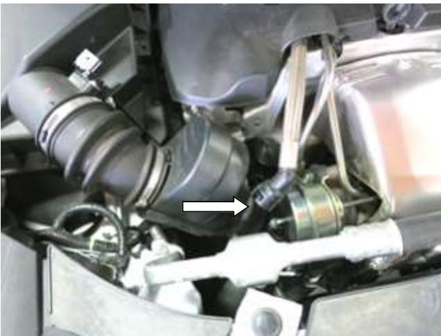
c. Release the quick-disconnect from the factory air intake tube. This will require using a thin flathead screwdriver to reach the clip.