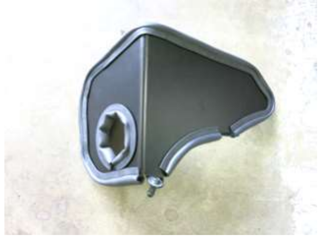
b. Install the edge trims and mounting hardware on the AEM heat shield as shown. Please refer to the illustration on pg. 2 for part details if needed. Edge trim will need to be cut to approx. lengths of 39", 12", and 6".