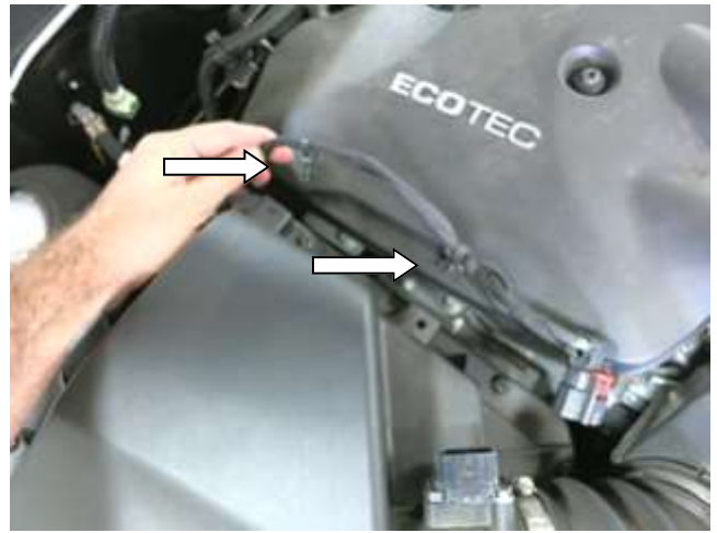
b. Release the MAF sensor wiring harness clips from the air box.