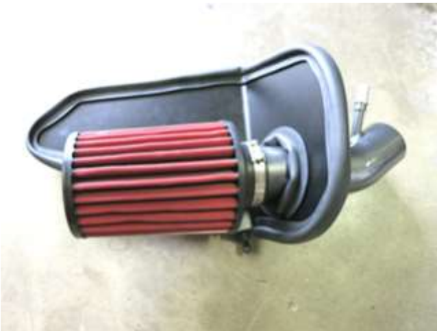
c. Insert the AEM intake tube into the heat shield opening and install the air filter with hose clamp as shown. Torque filter hose clamp to 30 in-lb at this time.