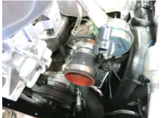
d. Install the hose with clamps onto the turbo compressor inlet as shown.