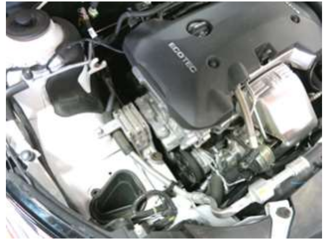
f. Engine compartment without factory air box assembly.