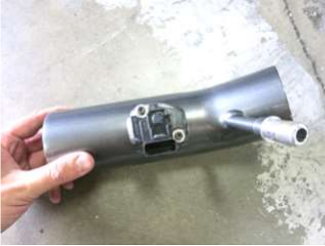
a. Install the MAF sensor into the AEM intake tube with the supplied M4 bolts.