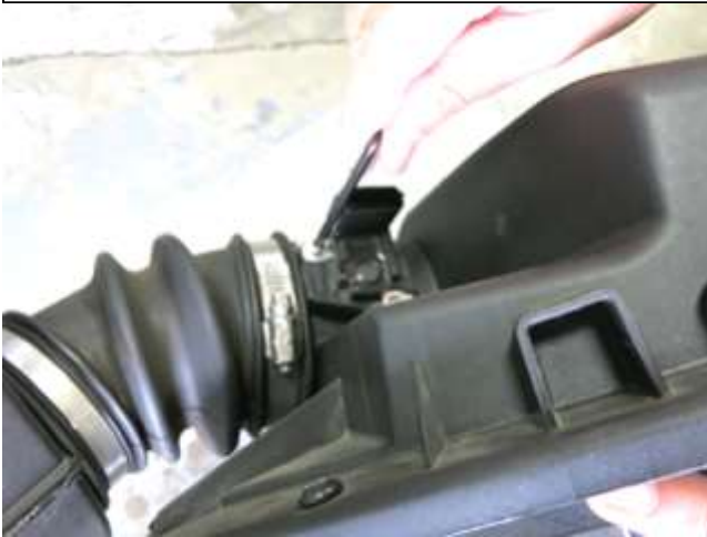
g. Loosen the MAF sensor screws and remove the sensor from the air box. The sensor will be reused in step 3a.