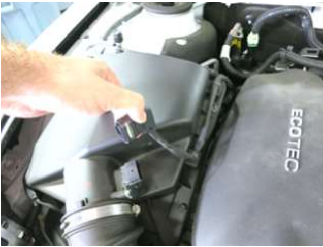
a. Unclip the red locking tab on the mass air flow (MAF) sensor connector to release the connector from the sensor.