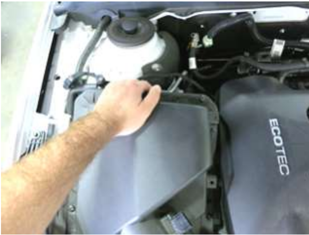
e. Pull up and remove the air box and tube assembly from the engine compartment. The tube will slip off of the turbo after lifting up on air box.