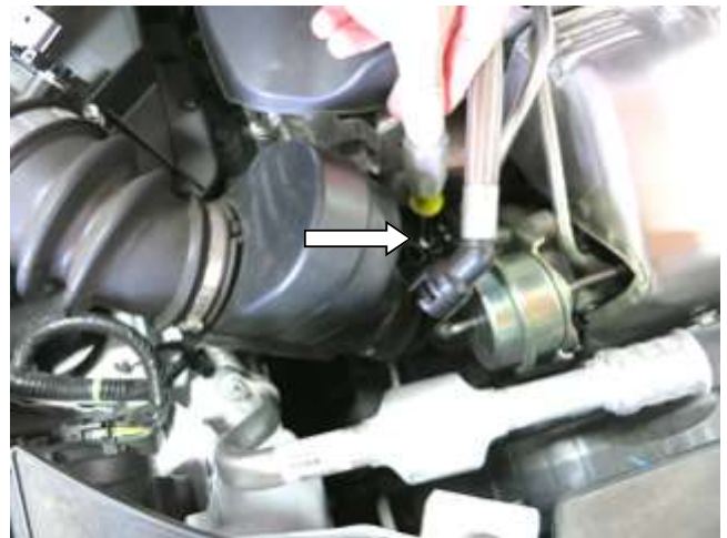
d. Loosen the hose clamp that secures the stock intake tube to the turbo.