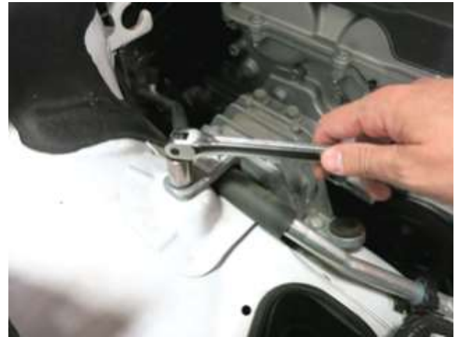
h. Loosen and remove the 15mm bolt on the engine mount. The bolt will be reinstalled in step 3f.