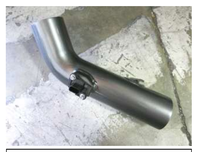
a. Install the MAF sensor into the AEM lower intake tube using the screws removed in step 2p.

a. When installing the intake system, do not completely tighten the hose clamps or mounting hardware until instructed to do so.