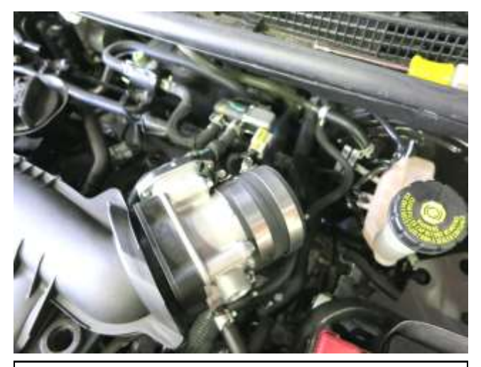
b. Install the provided coupler and hose clamps onto the throttle body. Torque the throttle body side hose clamp to 30 in-lbs at this time.