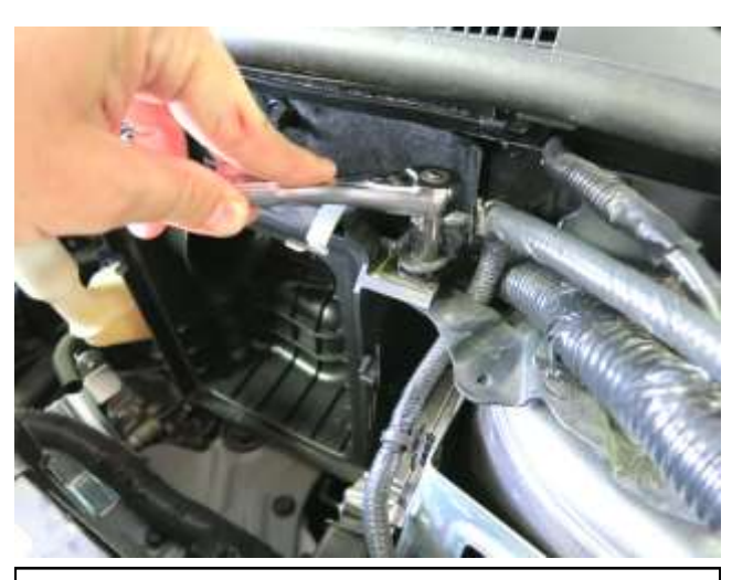
d. Unbolt the other section of the air box as shown.