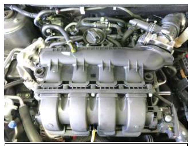
a. Remove plastic engine cover by pulling up with both hands gently.