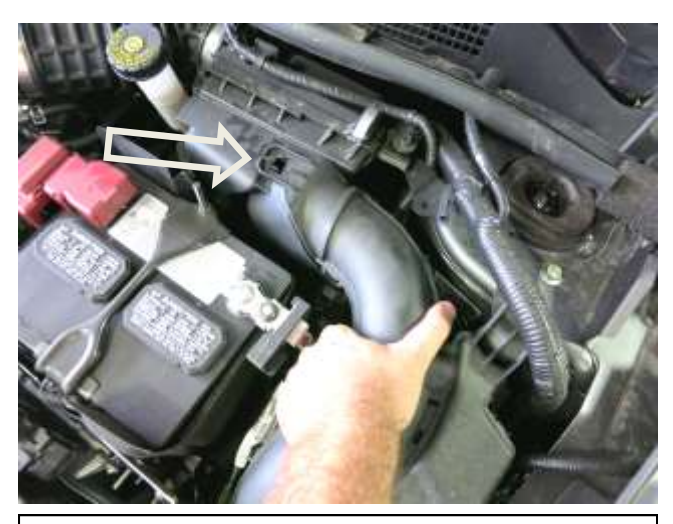
b. Remove the plastic air duct from the stock air box by pulling it straight up while lifting the tab where the arrow is pointing.

c. Unlatch the two clips holding the two halves of the air box together and remove the front section and air box by tilting it towards the front of the car and lifting it up and out.