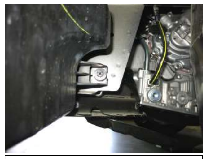
n. Lower the plastic fender liner to access the lower bolt securing the resonator and remove it.