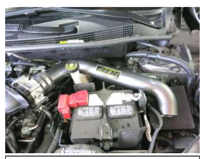
d. Install the AEM upper intake tube as shown and secure the bracket to the isolator using the nut and washer provided.