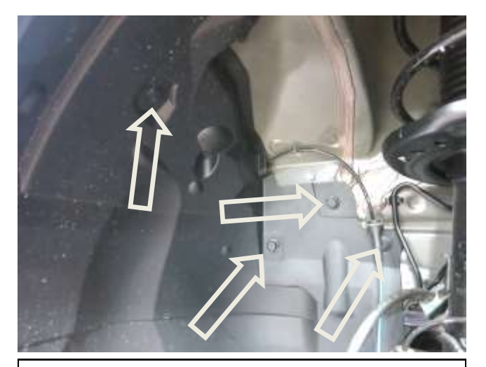
I. Remove the four pop outs shown in the inner fender well area.

o. Lower the plastic resonator out of the car as shown.Note: Do not discard any of your stock equipment.