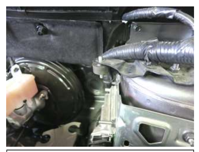
c. Thread the male-to-male rubber isolator mount to the underside of the air box mount as shown.