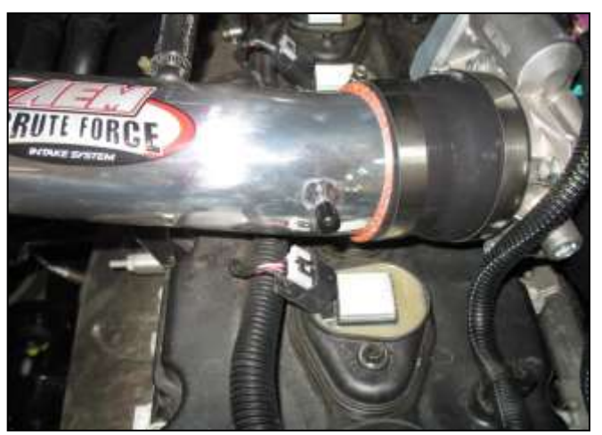
k. For 2006 and newer trucks you will need to plug off the smaller nipple located in the front of the pipe.