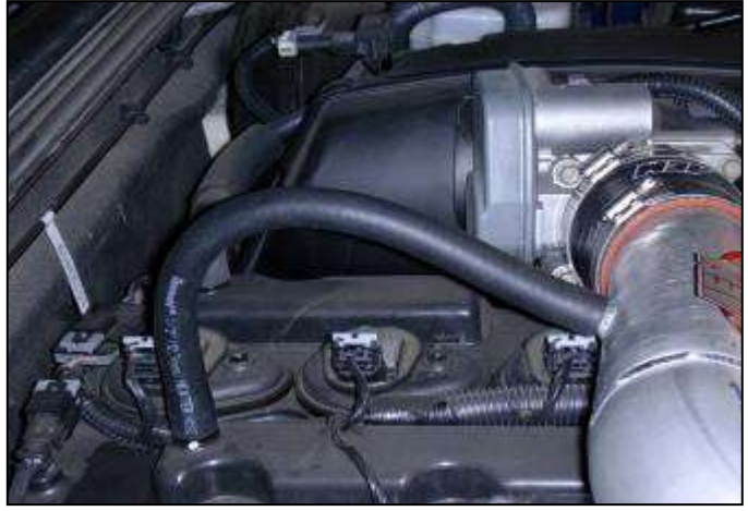
i. Attach the supplied \frac{1}{2} " hose between the intake pipe and the valve cover as shown. Trim to fit and secure using the supplied hose clamps.