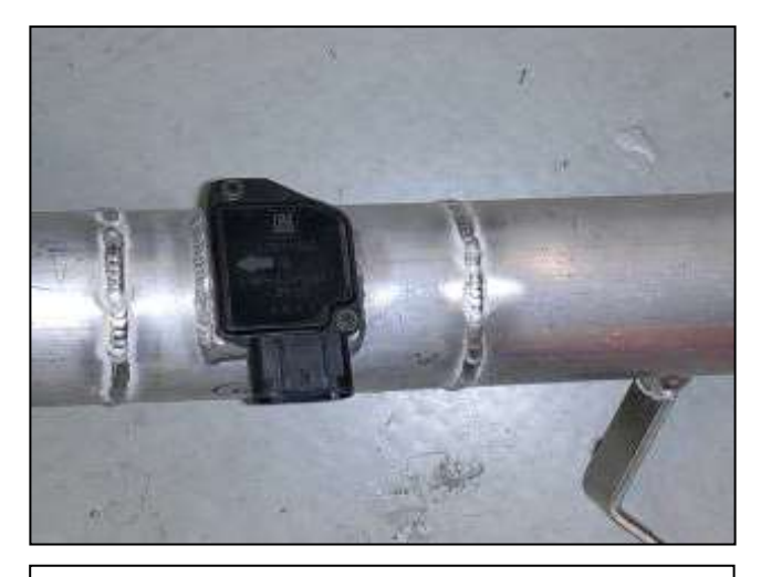
d. Install the MAF Sensor using the original mounting screws. Use caution to avoid damaging the o-ring.