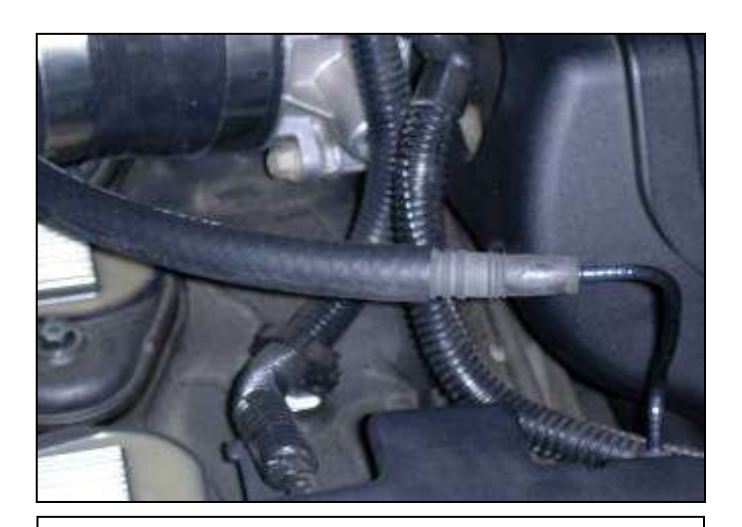
j. Insert the supplied plastic barb fitting into the end of the small breather hose removed in step 2d. Attach the supplied 5/16" hose between the plastic barb fitting and the intake pipe. For the 2006 and newer trucks refer to step 3k.