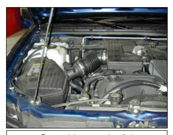
Factory air box system installed