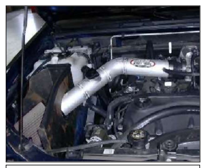
AEM® intake system installed