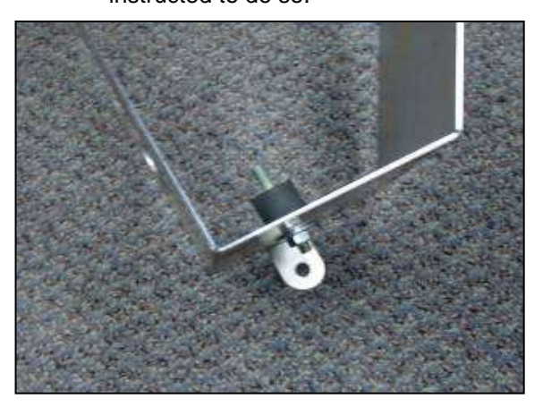
b. Install the supplied rubber mount on to the AEM<sup>®</sup> heat shield using one each of the supplied washers and locknuts.

a. When installing the intake system, do not completely tighten the hose clamps or mounting hardware until instructed to do so.