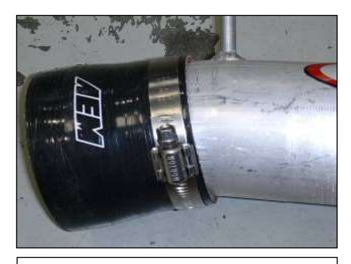
e. Install the reducing coupler on the end of the intake pipe using the #48 hose clamp.