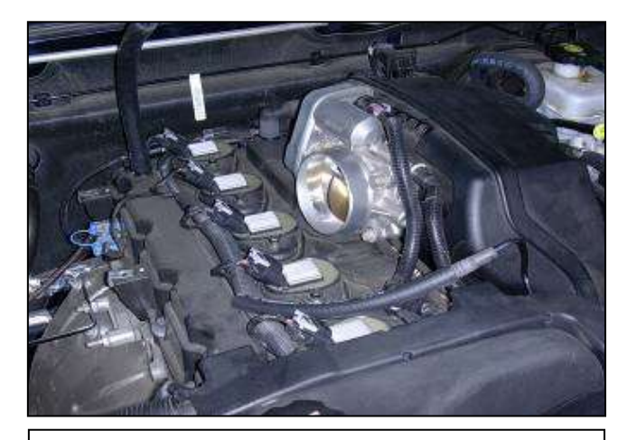
f. Factory air box system removed.