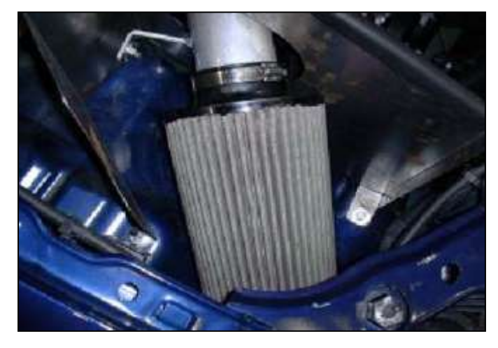
h. Check to be sure that the \mathsf{AEM}^{\$} air filter is clear from and debris. Attach the air filter to the end of the \mathsf{AEM}^{\$} intake pipe as shown.