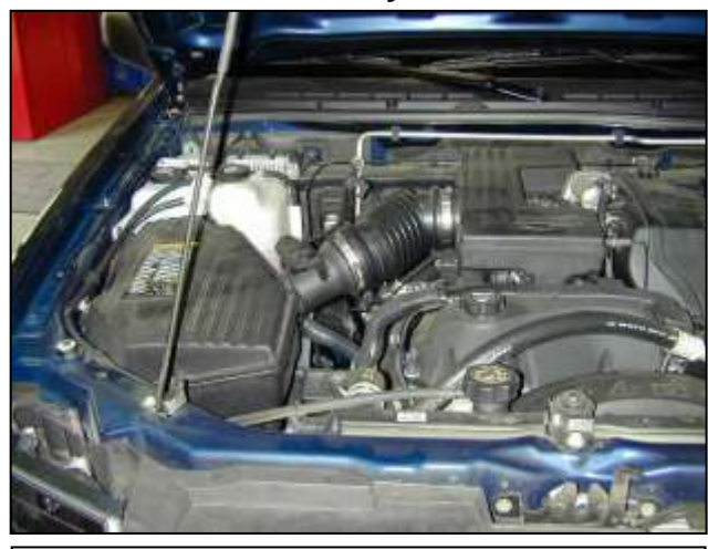
a. Factory air box system installed.