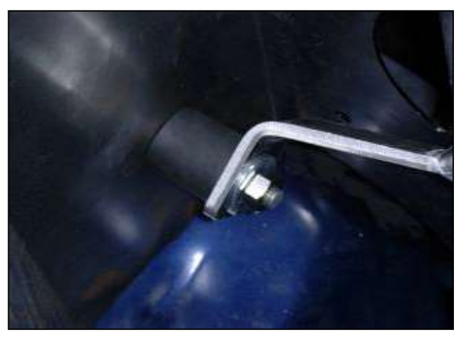
g. Align the intake pipe bracket with the rubber mount on the heat shield. Use the supplied washer and nylok nut to partially secure.