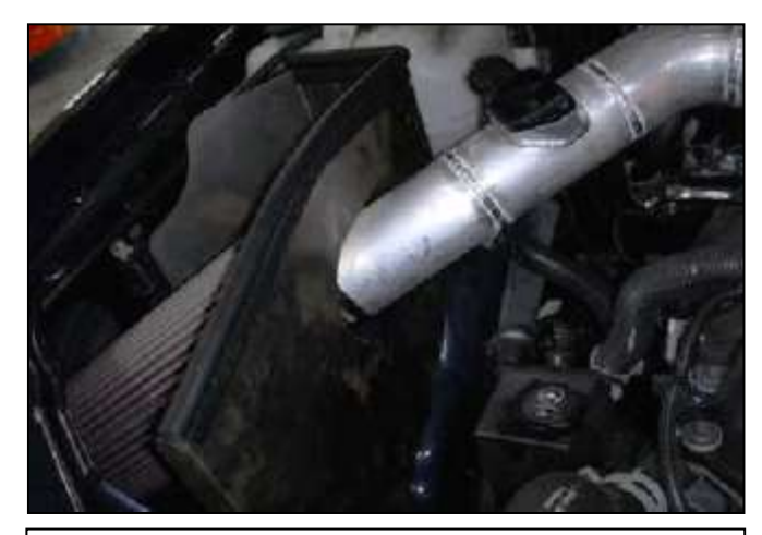
I. Position the AEM<sup>®</sup> intake for best fitment. Be sure that the pipe or any other component is not in contact with any part of the vehicle. Tighten the hose clamps at the throttle body. Tighten the nut on the mounting bracket. Re-adjust pipe if necessary. Re-connect the MAF wire harness.