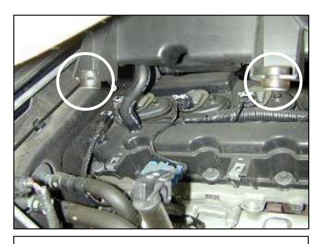
e. Remove the two bolts on the air resonator. Lift the resonator up and remove the breather hose from the valve cover. Remove the small breather hose from the front of the resonator and remove the resonator.