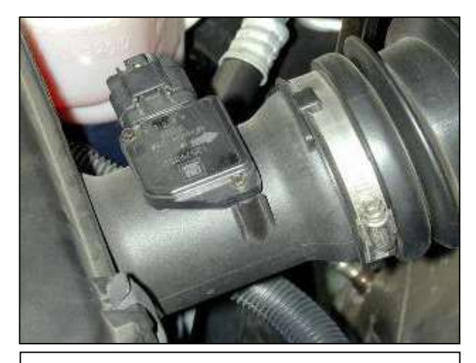
b. Unplug the wire harness from the Mass Air Flow (MAF) sensor. Remove the two screws retaining the MAF sensor and carefully remove the MAF sensor.