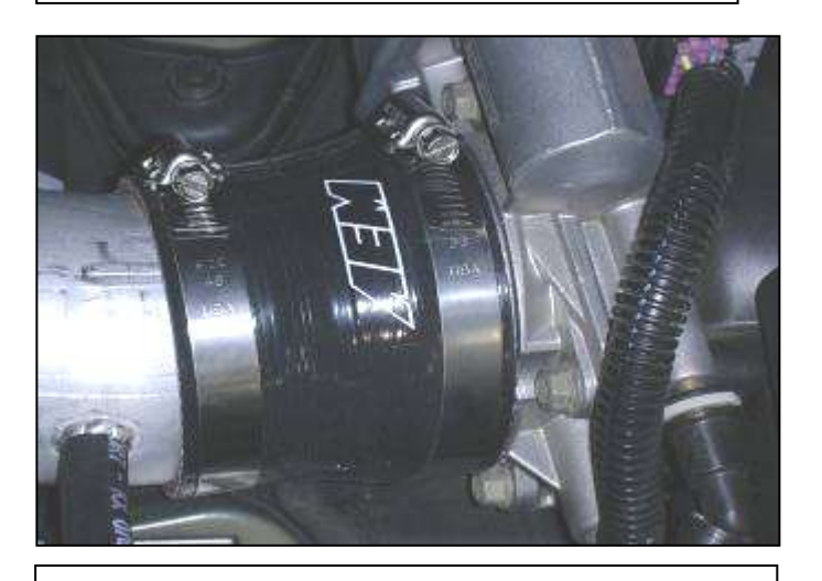
f. Slide the bracket side of the pipe through the heat shield hole. Align the coupler with the throttle body and secure using the #52 hose clamp.