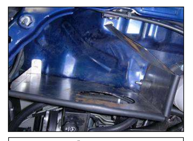
c. Install the AEM® heat shield using the two supplied bolts and washers and the original air box mounting nut. Install rubber edge trim to the top of the heat shield.