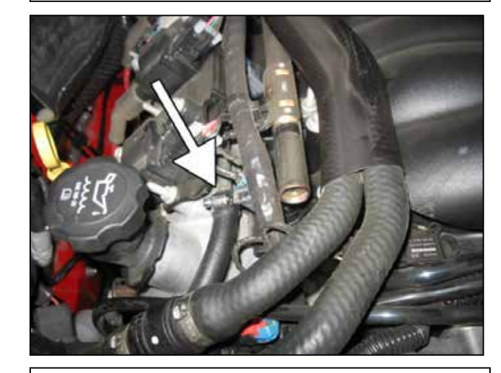
e. Secure the breather hose to the valve cover and re-install the engine cover.