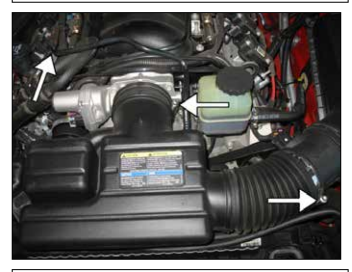
c. Remove engine cover (lift up and pull forward). Loosen hose clamps on the inlet tube at the throttle body and MAF body. Also disconnect and remove the breather hose from the valve cover.