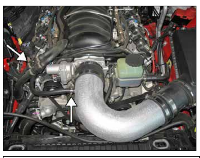
d. Route the breather hose around pulley and under AC lines.