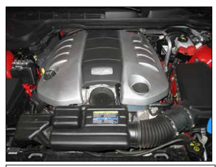
a. Factory air box system installed.