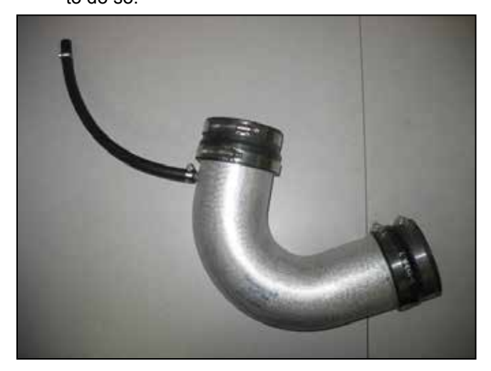
b. On the inlet pipe install the 5-439 elbow and breather hose. Loosely place clamps on couplers and breather hose.

a. When installing the intake system, do not completely tighten the hose clamps or mounting hardware until instructed to do so.