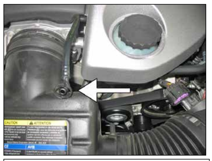
b. Unclip breather hose from resonator chamber