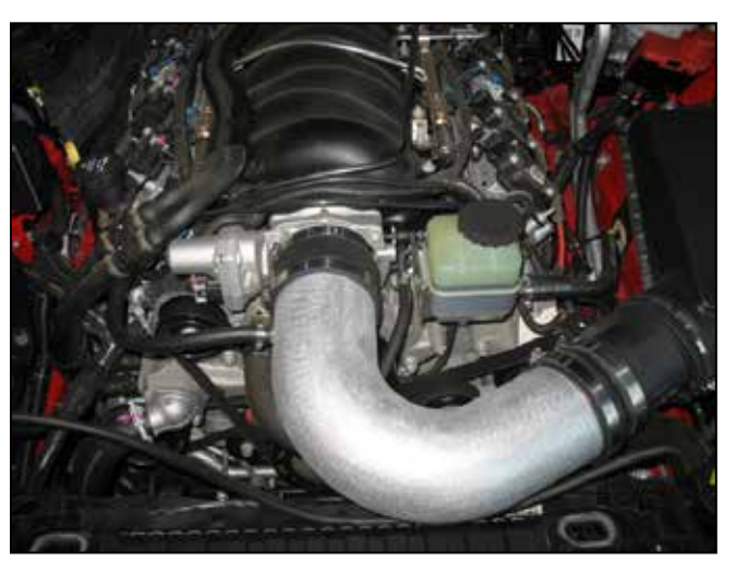
c. Slide coupler over MAF body, then the elbow over the throttle body, align inlet and secure the hose clamps.