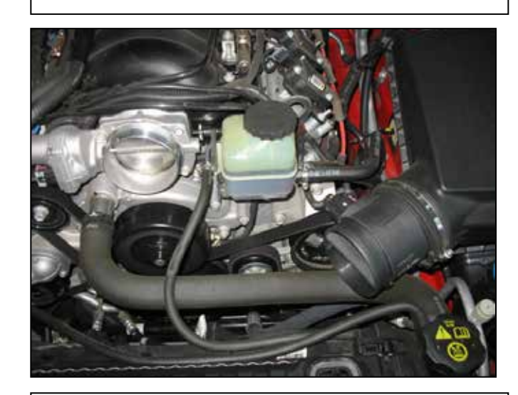
d. Remove the inlet tube.