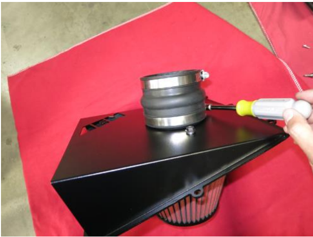
e. Install the hump hose (08657) and fasten it to the adapter using the hose clamp. Slide hose clamp onto the other end.