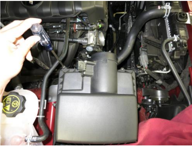
g. Use a Phillips screwdriver to remove the 4 screws securing the airbox lid to its base.