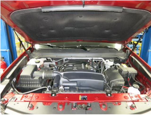
k. Factory air induction system.