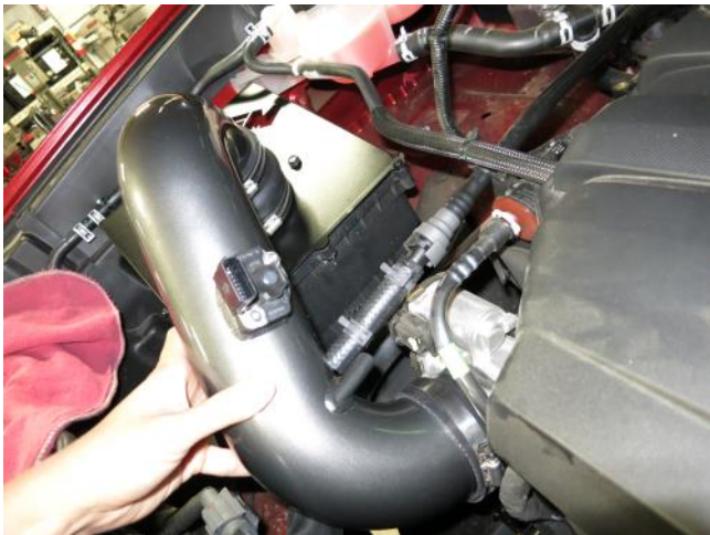
h. Connect the hose assembly and install the AEM tube as shown.