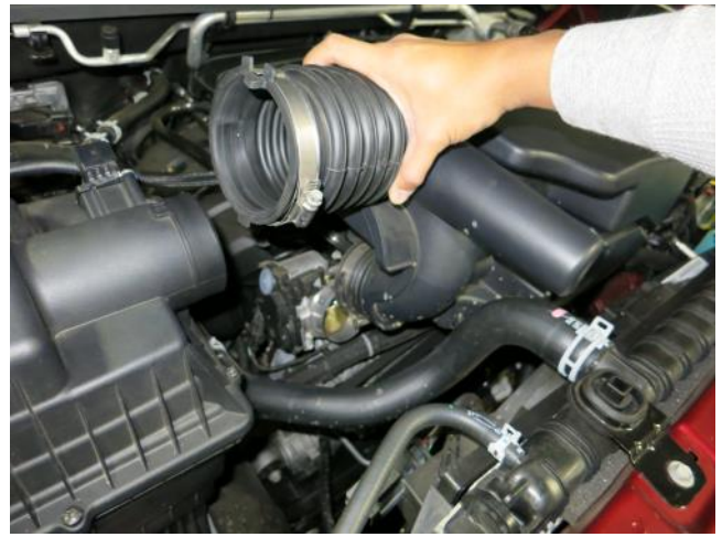
f. Slide the couplers off the airbox lid and throttle to remove the upper resonator assembly.