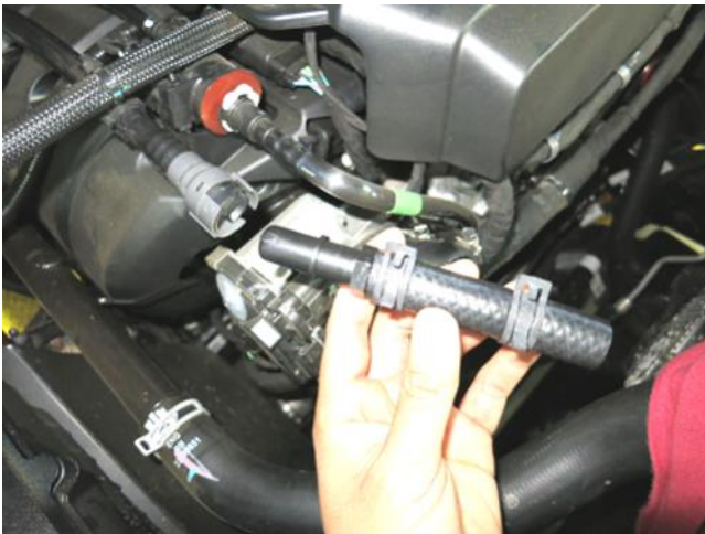
g. Assemble the hose with the spring clamps and quick disconnect nipple provided.