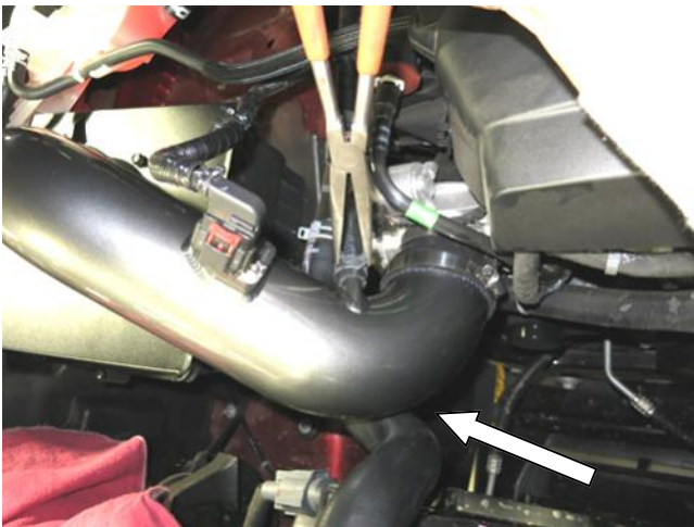
i. Use pliers to slide the spring clamp over the welded nipple. Reconnect the MAF harness to the sensor. Check for clearance with coolant hose and tighten hose clamps.