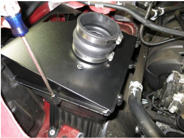
f. Fasten the heat shield to the stock lower airbox using the 4 screws provided.