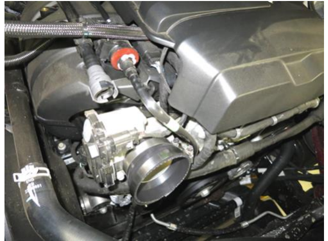
b. Install the coupler (084034) and hose clamps onto the throttle body.