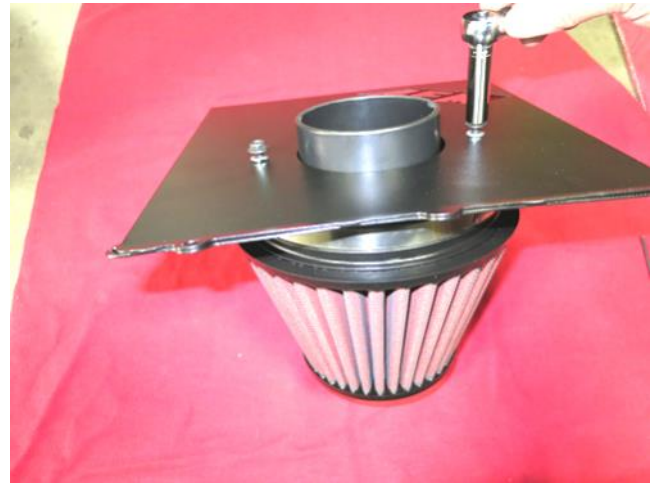
d. Fasten the adapter to the heat shield using the crush washers and m6 bolts provided.