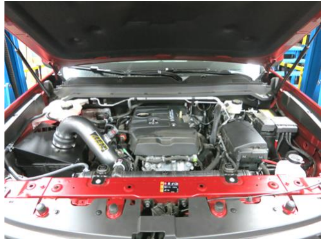
l. Finished installation of AEM Intake System.