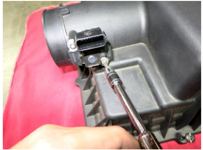
h. Use a T20 Torx bit to remove the MAF sensor from the airbox lid.