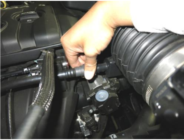
e. Disconnect the breather hose located at the rear of the stock intake tube.