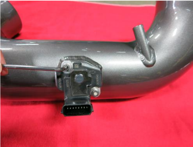
a. Use the provided bolts to install the MAF sensor into the AEM tube.