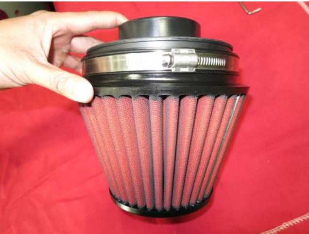
c. Insert the filter adapter into the filter and fasten with the hose clamp provided.