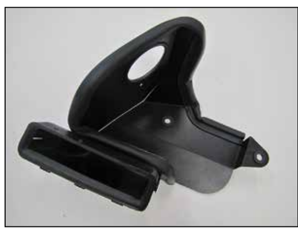
12. Install the factory fresh air duct into the heat shield as shown.