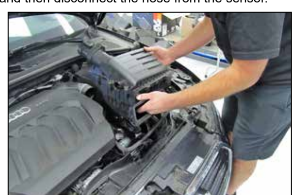
7. Pull up the air filter housing to remove it from the vehicle.