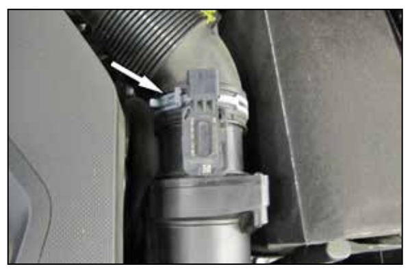
6. Release the spring clamp that secures the factory intake tube to the mass air sensor housing and then disconnect the hose from the sensor.