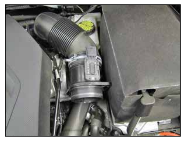
14. Reinstall the factory mass air sensor onto the factory intake tube and secure with the factory spring clamp.