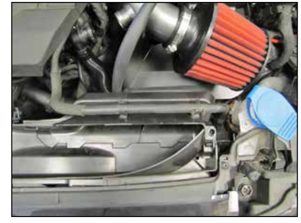
17. Reinstall the lower fresh air duct