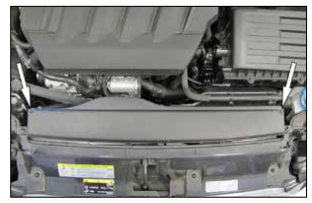
4. Remove the screws that secure the top of the fresh air duct and then remove the top from the vehicle.