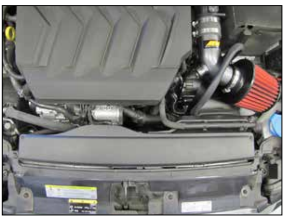
18. Reinstall the upper fresh air duct and secure with the factory hardware.