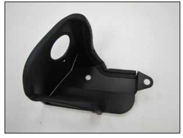
10. Install the provided edge trim onto the heat shield.