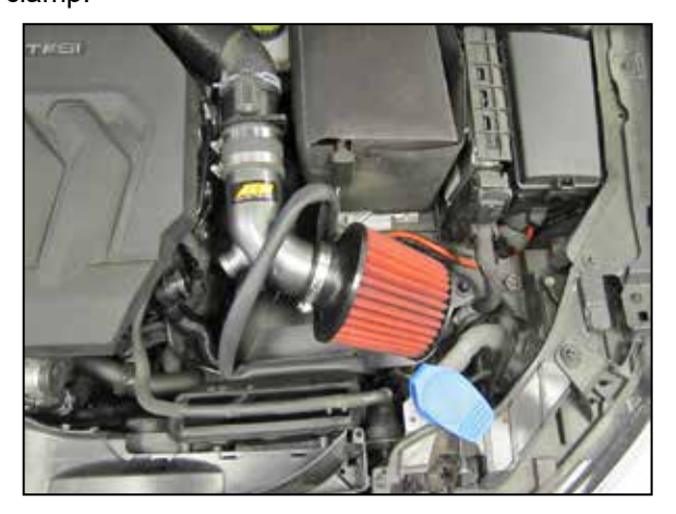
16. Install the AEM® intake kit so the grommets align with the mounting studs, connect the mass air sensor to the intake tube. Adjust the intake tube and filter for best fit and secure with the provided hardware and clamps.