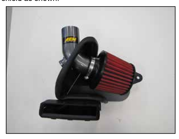
13. Install the rubber mounted stud into the heat shield and secure with the provided hardware. Install the AEM® intake tube into the heat shield and secure to the rubber mounted stud with the provided hardware. Install the AEM® air filter onto the intake tube and secure with the provided hose clamp.