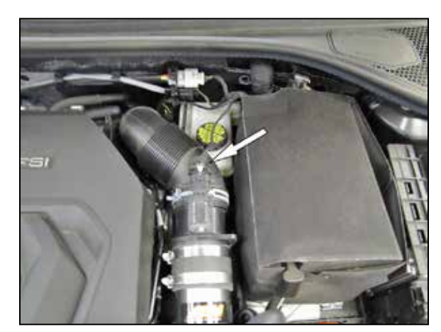
20. Reconnect the mass air sensor electrical connection.