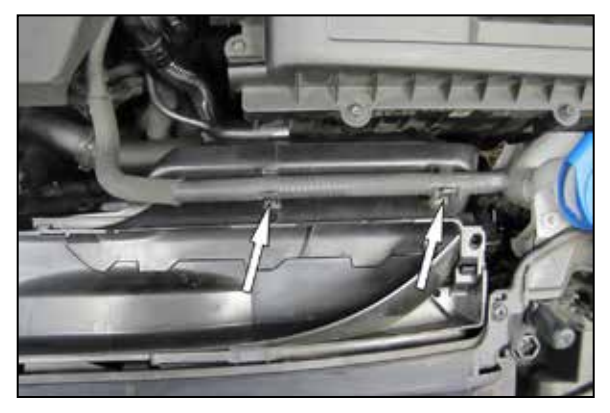
5. Unclip and move the coolant hose attached to the lower fresh air duct. Unclip and remove the lower fresh air duct from the vehicle.