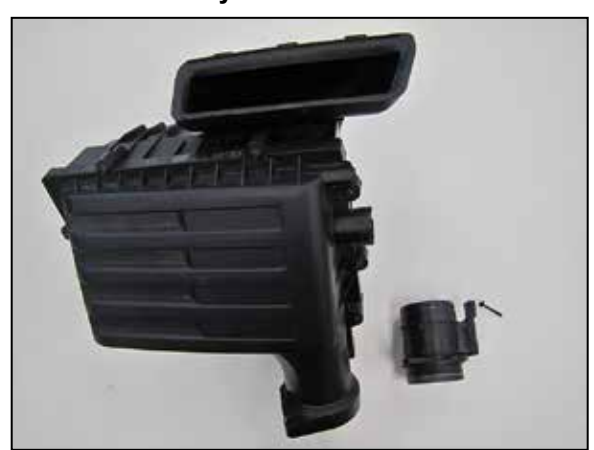
8. Remove the mass air sensor from the factory air filter housing.