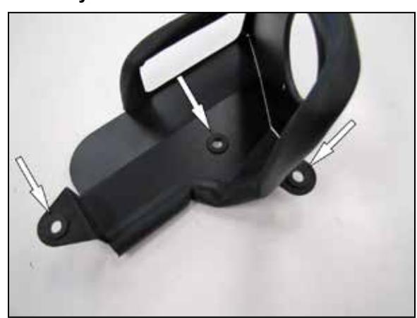
11. Install the three provided mounting grommets into the heat shield where shown.