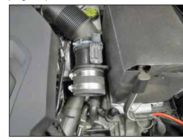
15. Install the provided coupler (08440) onto the mass air sensor and secure with the provided hose clamp.