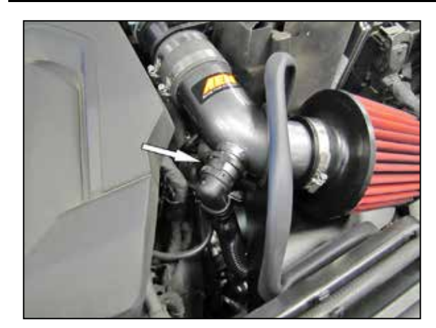
19. Connect the air injection hose to the AEM® intake tube.