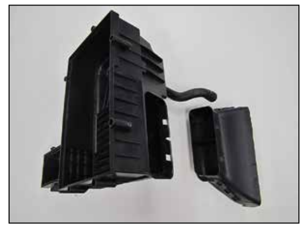
9. Remove the fresh air duct from the factory air filter housing.