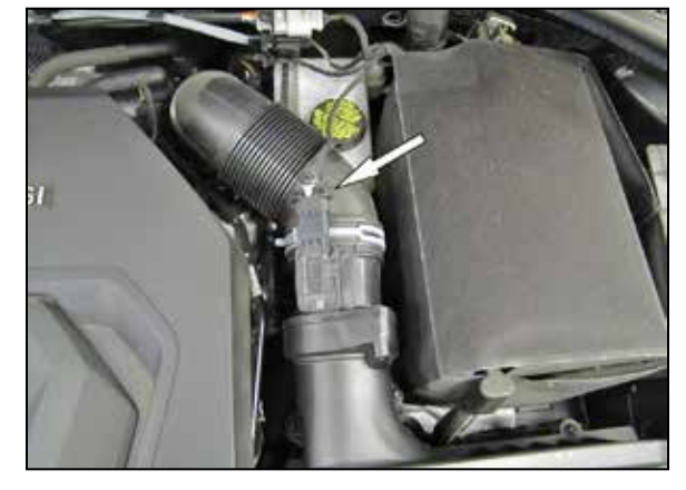
2. Disconnect the mass air sensor electrical connection.

NOTE: Disconnecting the negative battery cable erases pre-programmed electronic memories. Write down all memory settings before disconnecting the negative battery cable. Some radios will require an anti-theft code to be entered after the battery is reconnected. The anti-theft code is typically supplied with your owner's manual. In the event your vehicles anti-theft code cannot be recovered, contact an authorized dealership to obtain your vehicles anti-theft code.