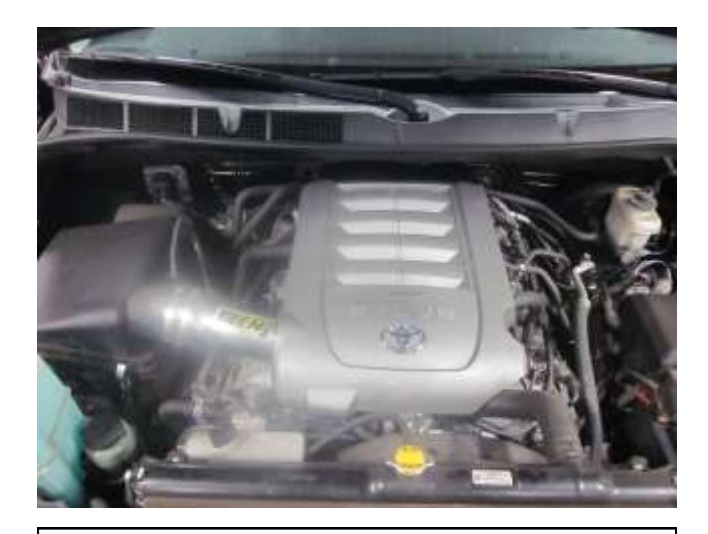
AEM<sup>®</sup> intake system installed