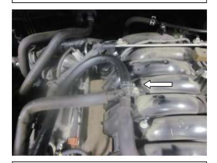
h. Route the hose (5-7022) as shown and install on the "T" fitting and tighten provided hose clamp (08411).

f. Lift the air box slightly and slide the AEM intake into the throttle body hose, then the air box hose while lowering the air box over the mount installed in 3b. Tighten all four hose clamps at this point.