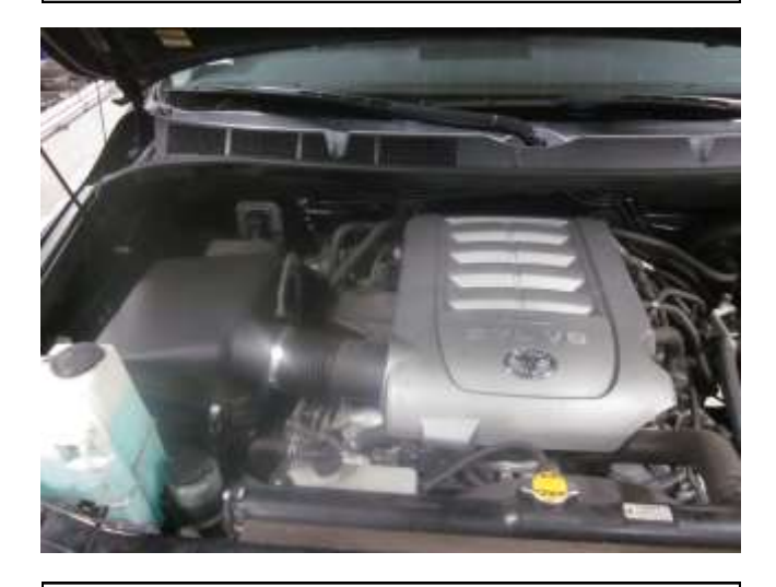
Factory air box system installed

i. Make sure air box is sitting on the previously installed mount and install the washer (559960) and nut (444.460.04) and tighten. Also re-install and tighten the backside bolt that was removed in step 2e.