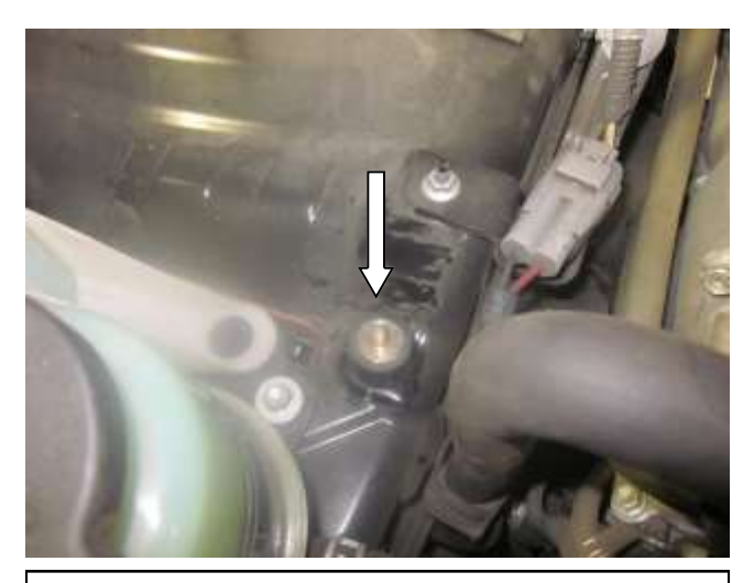
b. Install the provided (1228560) mount into the body of the vehicle where the M6 bolt was removed in 2e.

c. Install the lower air box into the vehicle by squeezing the air accelerator and inserting it into the fender opening in the vehicle. Note : it 's easier to have the air box lid and base separated to perform this step.