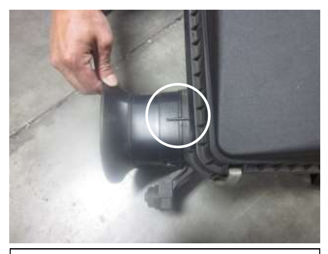
a. Install the AEM air accelerator onto the air box by aligning the slot in the box and the air horn.

a. When installing the intake system, do not completely tighten the hose clamps or mounting hardware until instructed to do so.