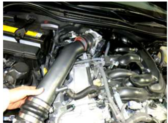
d. Install the hose clamps onto each previously installed hose coupler. Position the tube(2-1540C) as shown.