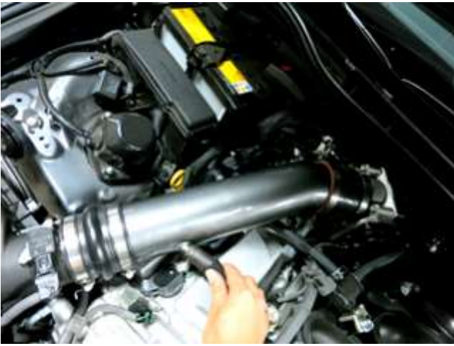
e. Reconnect the breather hose to the AEM tube.