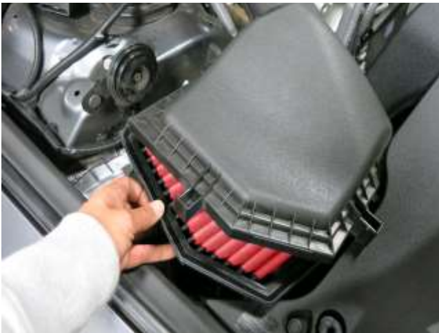
a. Install the AEM panel Filter(28-20452).