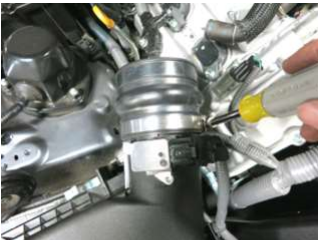
c. Install the supplied hump hose(5-586) and hose clamp (9452) onto the factory airbox lid as shown.