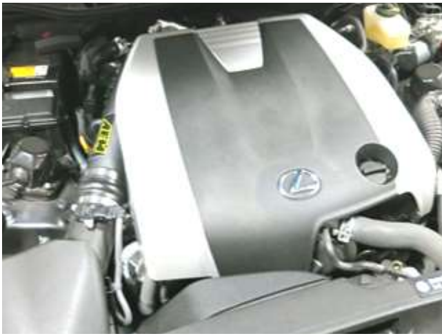
f. Reinstall the engine cover. Check for clearance between the tube, engine, and engine cover prior to fastening all hose clamps.