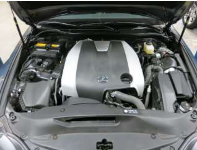
g. Factory air induction system.