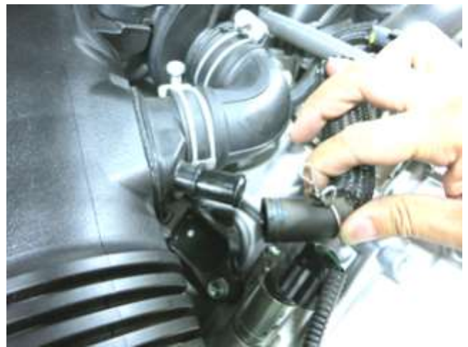
b. Disconnect the breather hose from the stock intake tube.