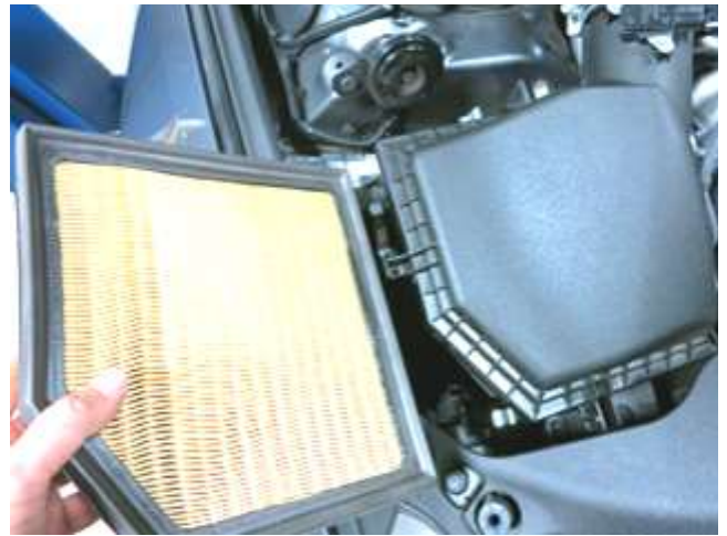
f. Remove the stock panel filter.