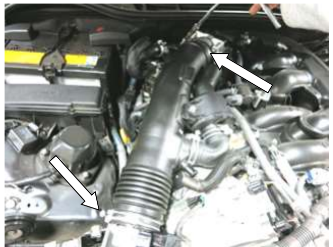
d. Loosen the stock hose clamps on both ends of the intake tube using a 10mm socket and remove the tube.