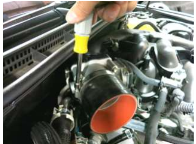
b. Install the supplied coupler(5-325 for IS350; 5-323 for IS250) and fasten the hose clamp(9452) to the throttle.