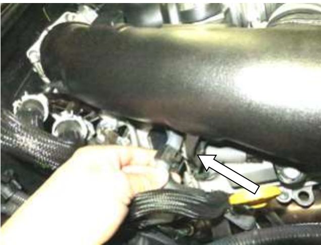
c. Detach the vacuum line harness from the intake tube as shown.