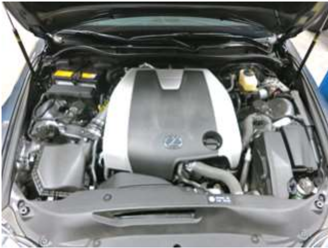
h. Finished installation of AEM Intake System.