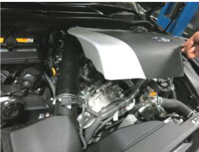
a. Lift up the engine cover and set aside.